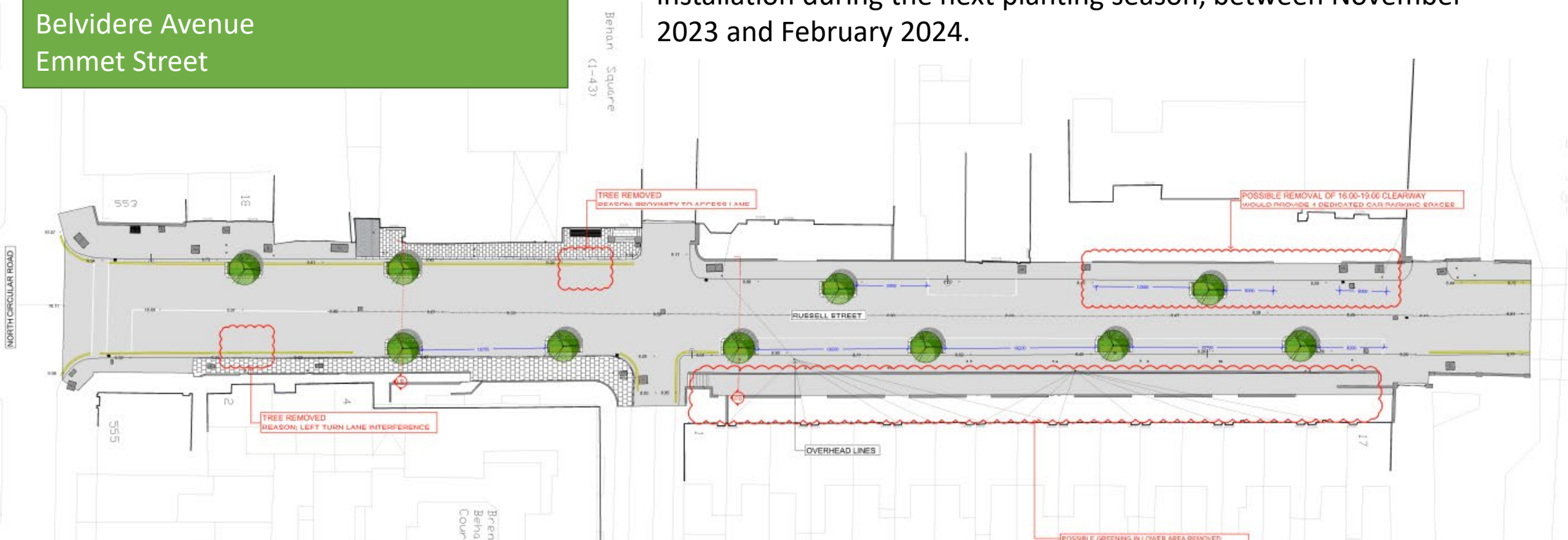
Russell Street, Dublin 1

Portland Square will have an on-site meeting with the residents to discuss possible future improvements, as agreed during the public consultations. Should the final plan receive approval, our aim is to commence the installation during the next planting season, between November 2023 and February 2024.