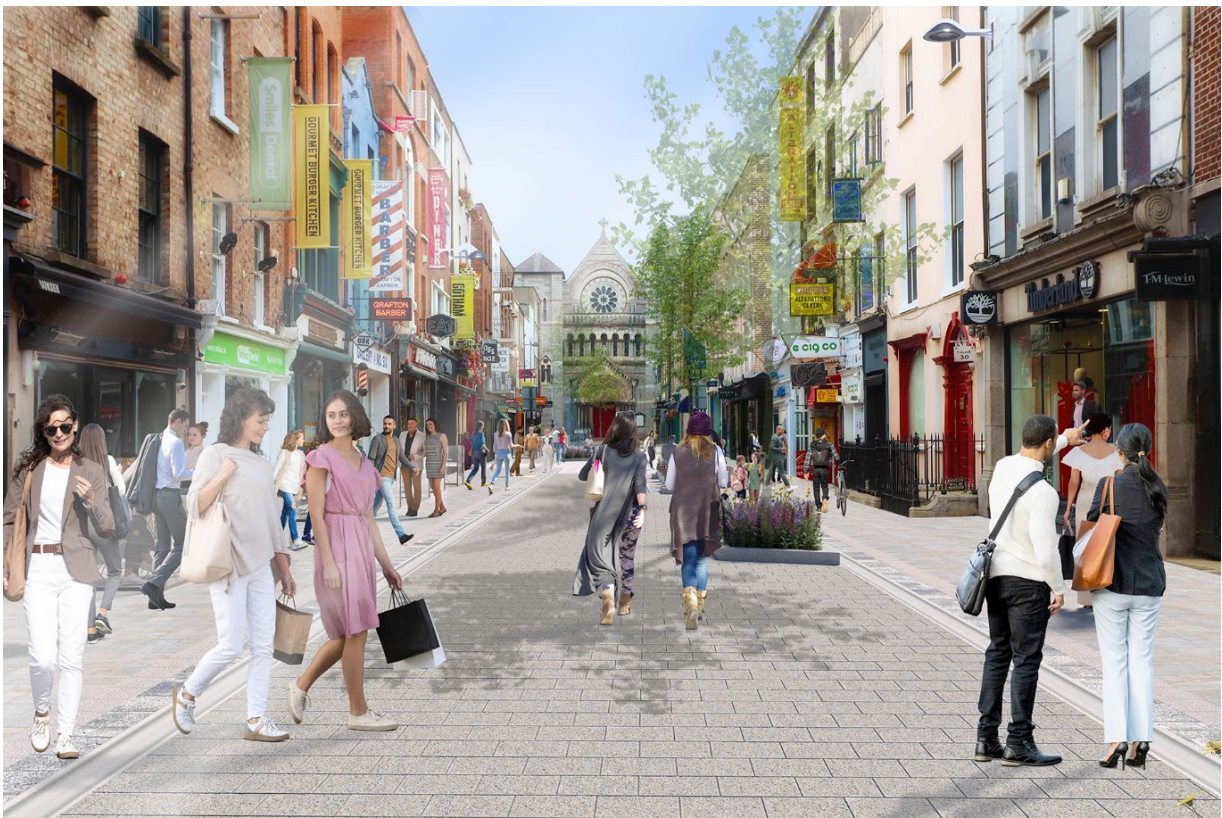
Artist's impression looking east towards St Ann's Church

Design Intent - To deliver a vibrant, active and accessible public space using high quality materials with particular focus on universal design, greening, conservation and sustainability.