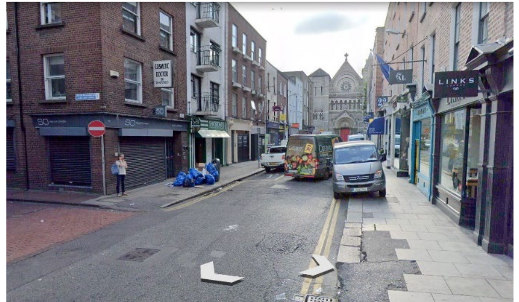
Images from before resurfacing works