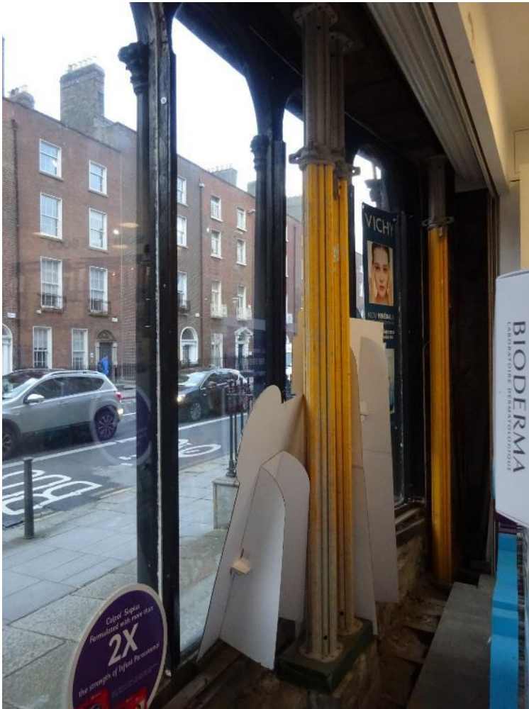
Emergency Temporary Propping - BHIS 2020