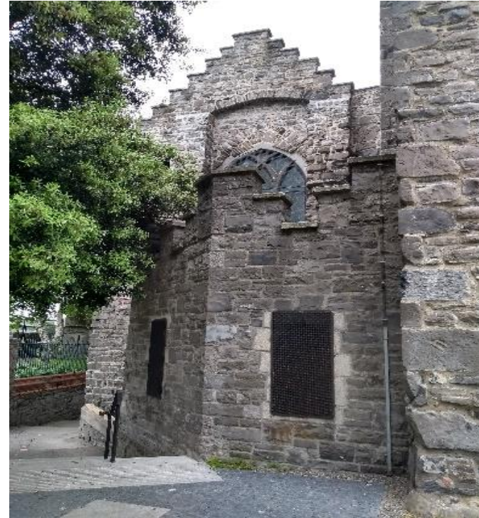
BHIS 2022 – Completion of works to west gable