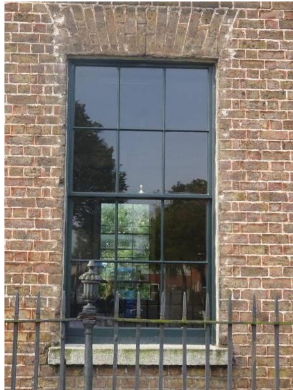
Window Reinstatement 2022