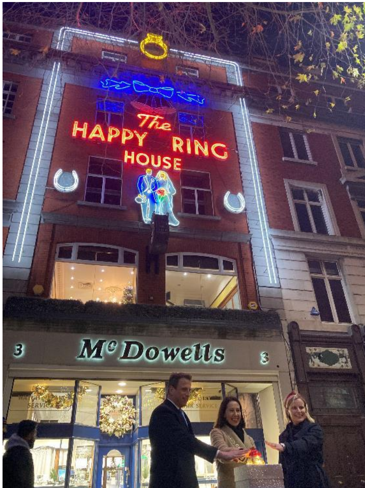
Repair of Neon Lighting 2021