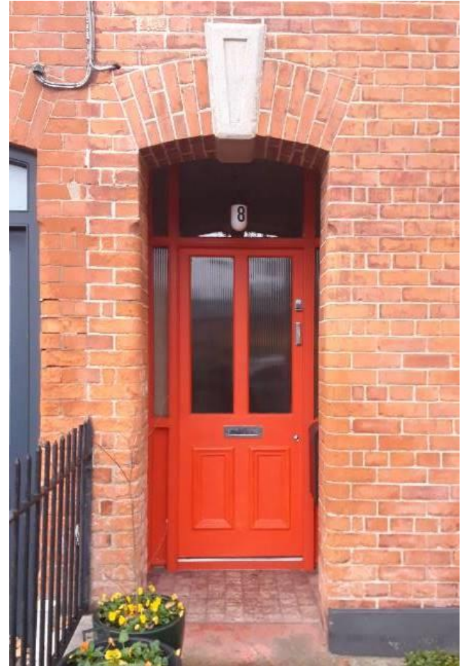
No.8 – Repair of Historic Door - 2021