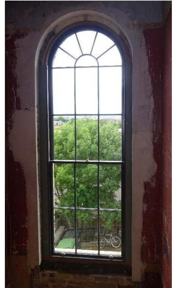
Window Reinstatement 2021