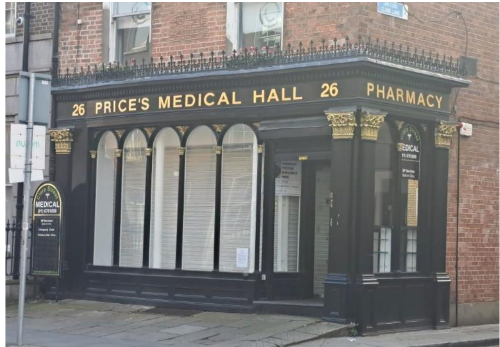
Repair of Victorian shopfront – HSF funding 2021