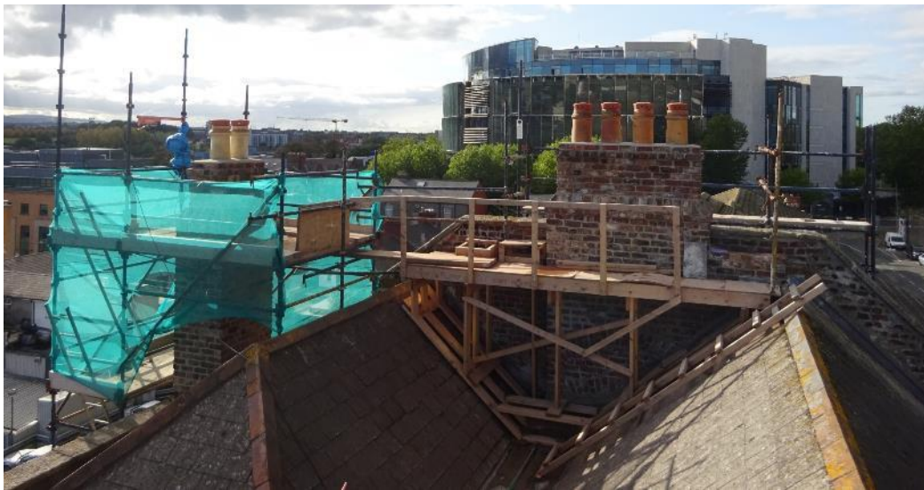
Chimneystacks & Roof Repair 2020