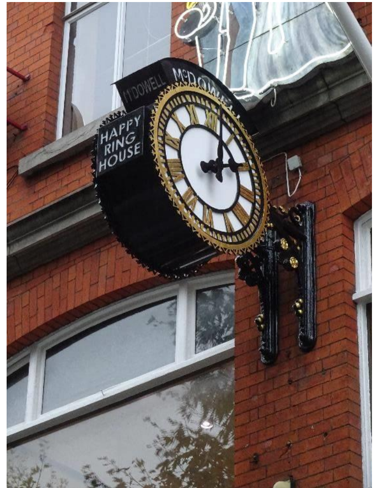
Repair of Clock 2022