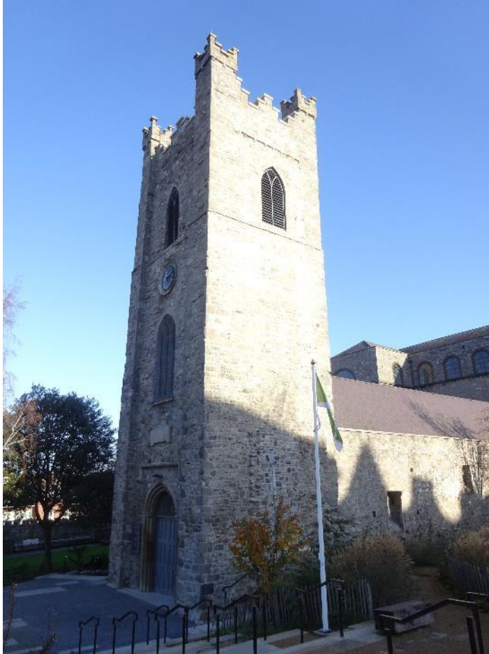
HSF 2020 – Completion of works to the tower