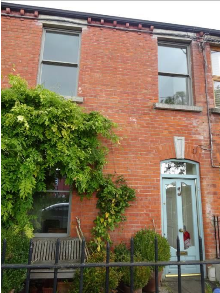
No.30 – Reinstatement of Historic Windows - 2020