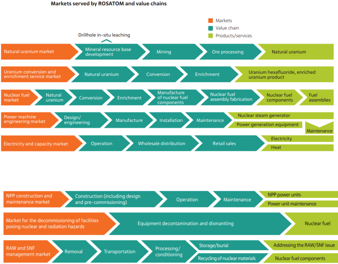
Figure 1: Markets served by ROSATOM and value chains 20

Its political importance can be easily demonstrated by the following “staffing decisions”: In 2016, Russian President Vladimir Putin appointed Rosatom Director General Sergey Kirienko as the First Deputy Head of the Presidential Administration with immediate effect. Before becoming the head of Rosatom, Kirienko led the Russian Federal Atomic Energy Agency for two years. 21 Currently, he is the Chairman of the Supervisory Board of Rosatom.