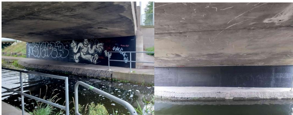
South Central Area Committee December 2022

Apx 5,105 Sq. metres of graffiti have been removed or painted over across the South Central Area. Repeat locations are largely within the City areas of Dublin 8 namely: Augustine St, Engine Alley, Cornmarket, Thomas St, Carman's Hall Marks Alley, Swift's Alley, Hanover Lane/ Arch and Inchicore from Emmet Road to Grattan Crescent. Suir Rd, Dolphins Barn and Blackhorse, Bluebell and Kylemore Rd along the Grand Canal and luas route are regularly tagged and have had extensive graffiti removal treatments.