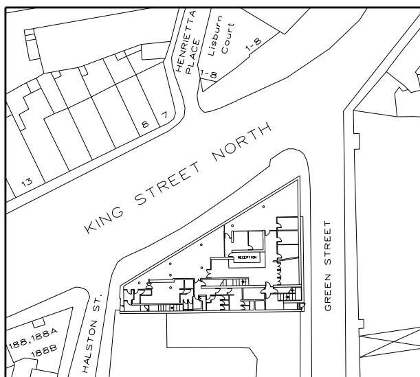
LOCATION MAP (SCALE 1:1000)