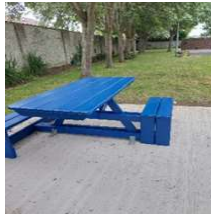
St. Bridget's Court