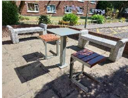
Chessboard table, St. Anne's Court