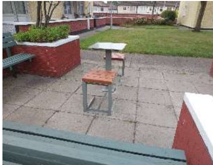
Chessboard table, St. Johns Court