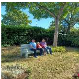
New four-seater bench