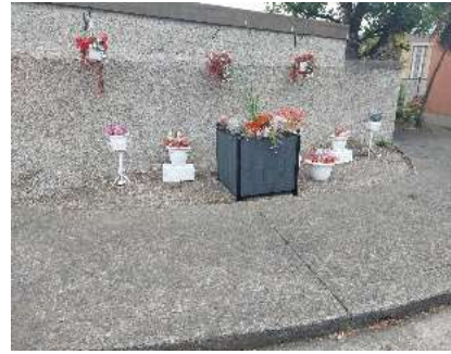
St. Johns Court