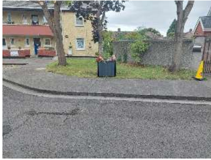
St. Johns Court