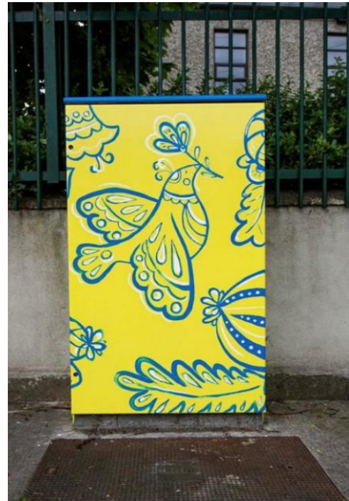
St. Catherine's Infant School, Ratoath Road, Cabra, Dublin 7.