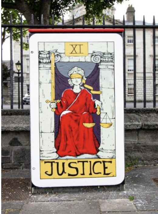
Located @ Law Society of Ireland, Blackhall Place, Stoneybatter, Dublin 7.

Fifteen boxes were transformed across the Central area this year thanks to Dublin Canvas, please see some images below: