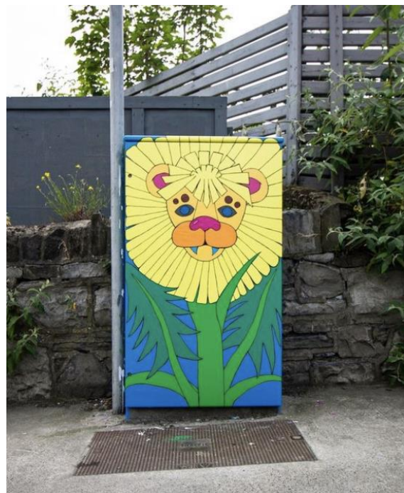
East Road, Church Road, East Wall, Dublin 3