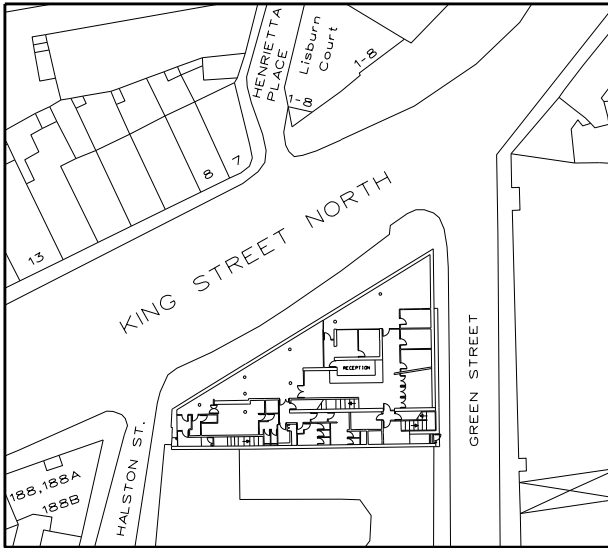
LOCATION MAP (SCALE 1:1000)