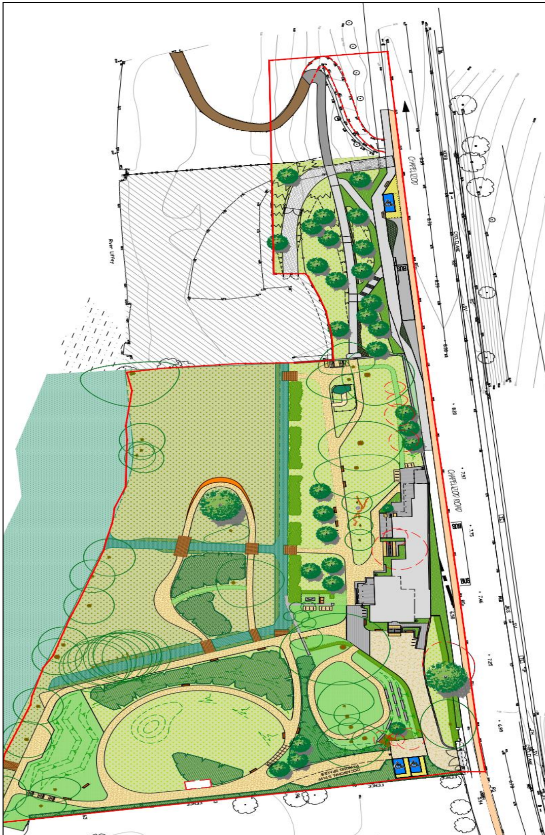
General site layout showing from east to west, new vehicular entrance to Chapelizod Road, new landscape arrangement with paths, rewilding, clearing of ditches, restored house and new classroom etc., new entrance from west to the orchard site, new bus pull in and disabled parking space and new link to Liffey Valley Park and Chapelizod.