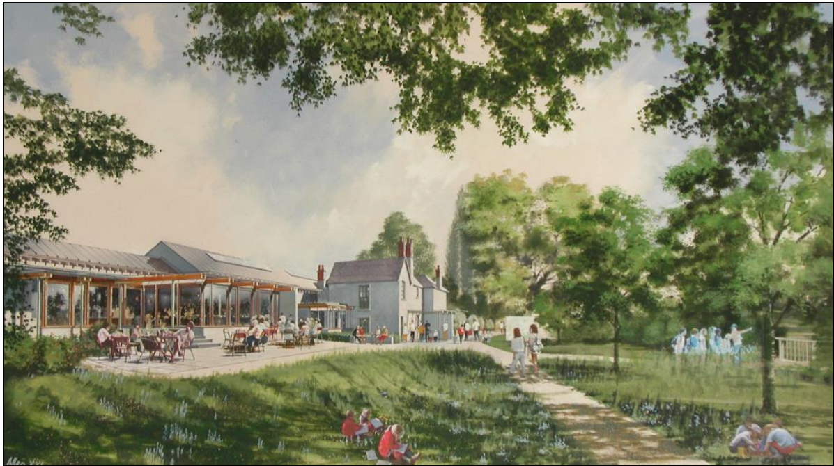
Artist Impression looking east with new classroom, toilets and café on the left