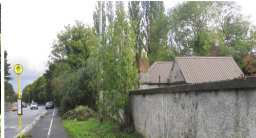
Existing Site Condition