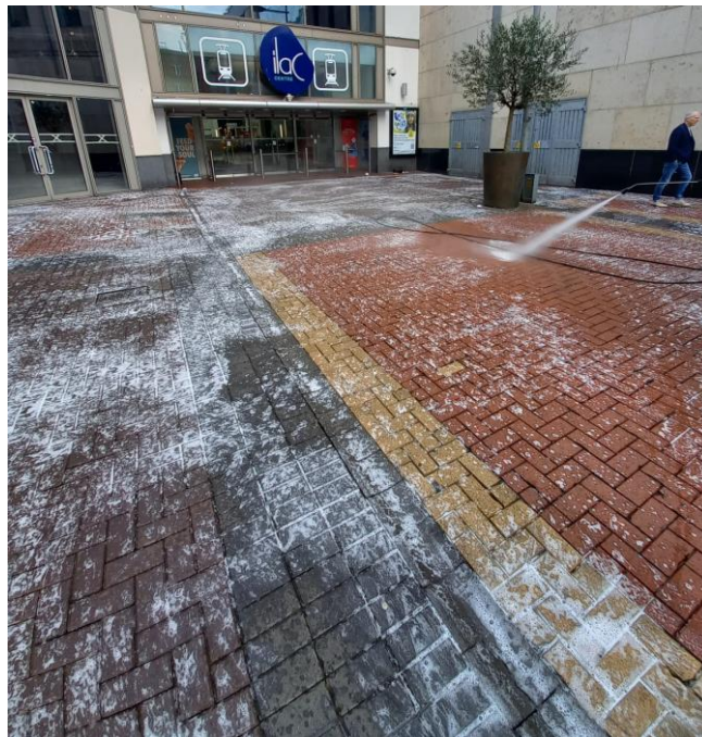
Image taken outside the Ilac Centre, Off Henry Street

Please contact this office if there is a location you feel would benefit from their attention.