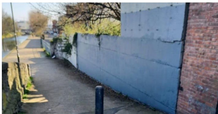
Graffiti removed from wall at Clarks Bridge by Probation Services