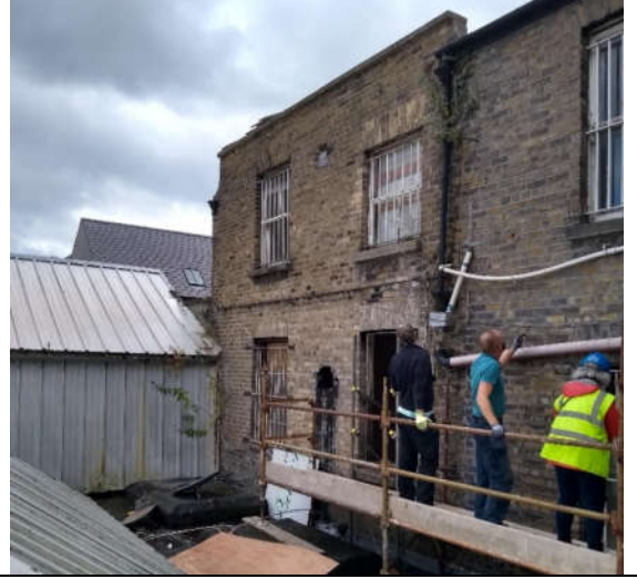
Figure 4: Rear of 20 Moore Street