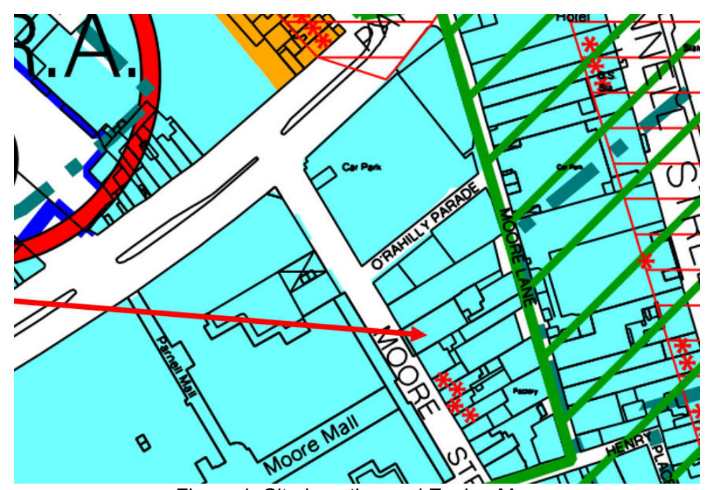
Figure 1: Site Location and Zoning Map

20/21 Moore Street is located in an area zoned Z5, the objective of which is: "To consolidate and facilitate the development of the central area, and to identify, reinforce, strengthen and protect its civic design character and dignity".