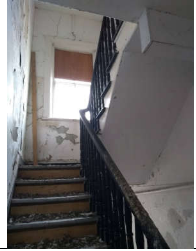
Figure 5: Surviving dogleg, open string Figure 6: Corner fireplace staircase with continuous handrail.