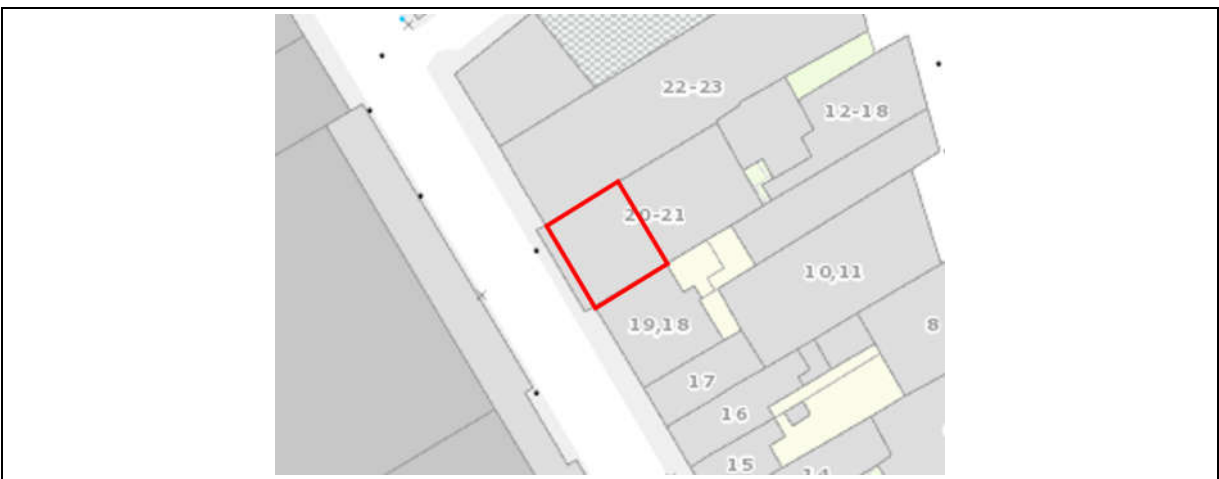
Fig. 2: 20/21 Moore Street, Dublin 1: extent of Protected Sturcture status and curtilage outlined in red.

The extent of protected structure status & curtilage is shown on the map below in red.