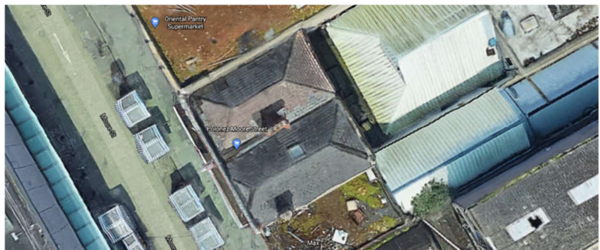
Fig. 7: 20/21 Moore Street showing early roof form perpendicular to street with hipped sections to front and rear (Google Earth 04/12/20) Historic Map