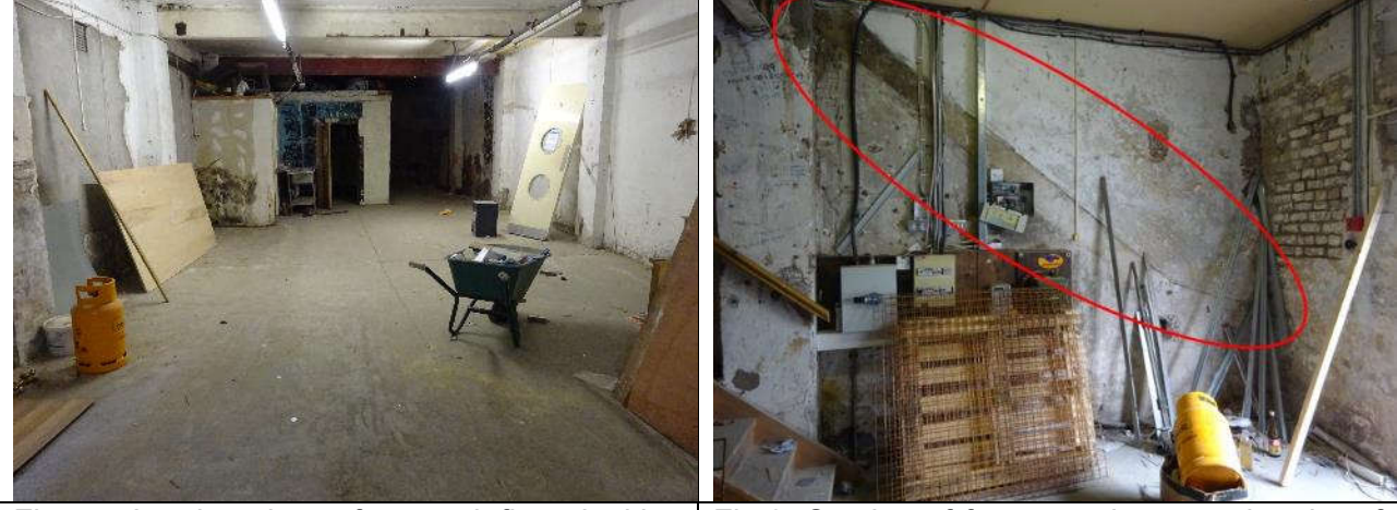
Fig. 7: Interior view of ground floor looking Fig.8: Scaring of former staircase to interior of the west elevation (highlighted in red).

Fig. 6: Exposed section of early 19<sup>th</sup> century red brick to the southern part of the east elevation, understood to relate to the tenement building at No. 4 Moore Place.