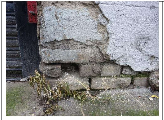
Fig. 5: Exposed section of stock brick dating from c.1920 at low level to the northeast corner of main Henry Place elevation.