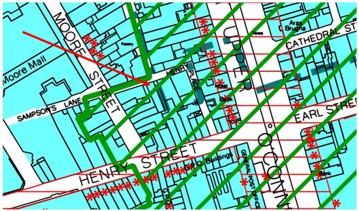
Fig. 1: Site Location and Land Use Zoning

No.10 Henry Place, Dublin 1 is located in an area zoned Z5, the objective of which is "To consolidate and facilitate the development of the central area, and to identify, reinforce, strengthen and protect its civic design character and dignity".