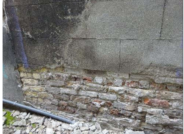
Fig. 6: Exposed section of early 19<sup>th</sup> century red brick to the southern part of the east elevation, understood to relate to the tenement building at No. 4 Moore Place.