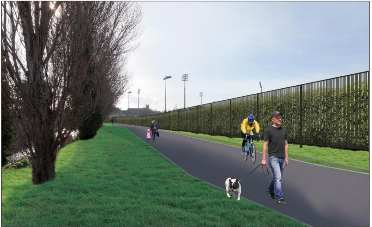
Photomontage at north end of scheme close to Eglinton Terrace.