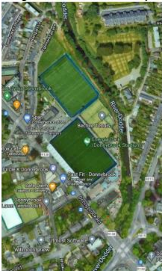
Site location map

Construction is expected to commence later in Q1 2022 and it is anticipated the project will take 8 months to build.