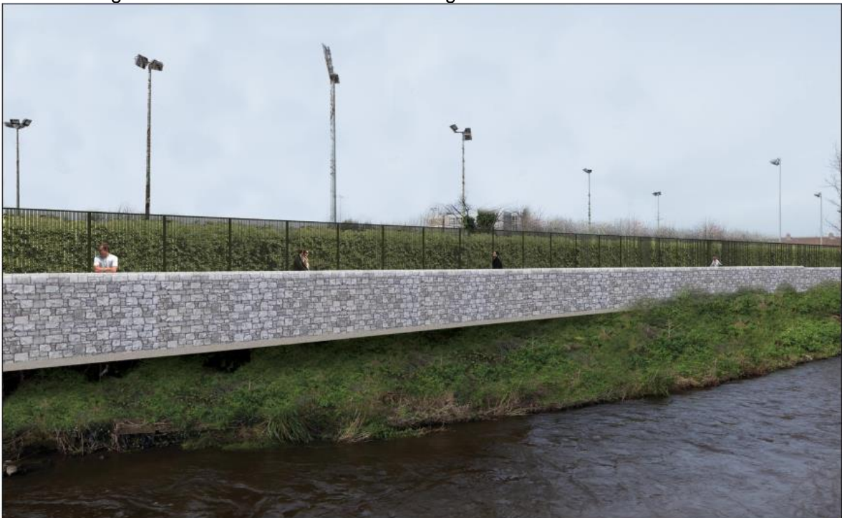
Photomontage at the mid-section of scheme.