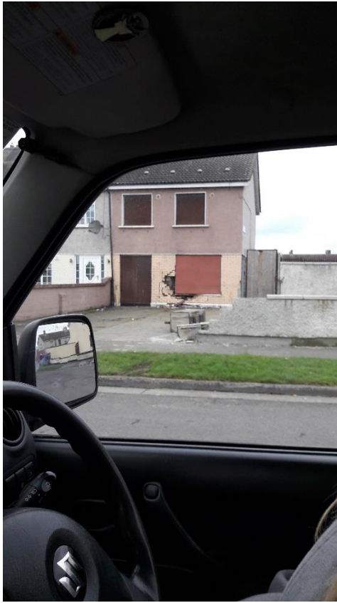
The Side Garden is the site for a New House