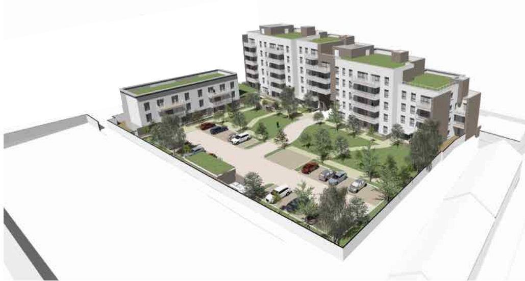
2. Birds eye view from south east