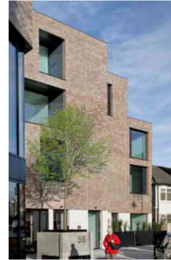
3. Precedents for brick finish