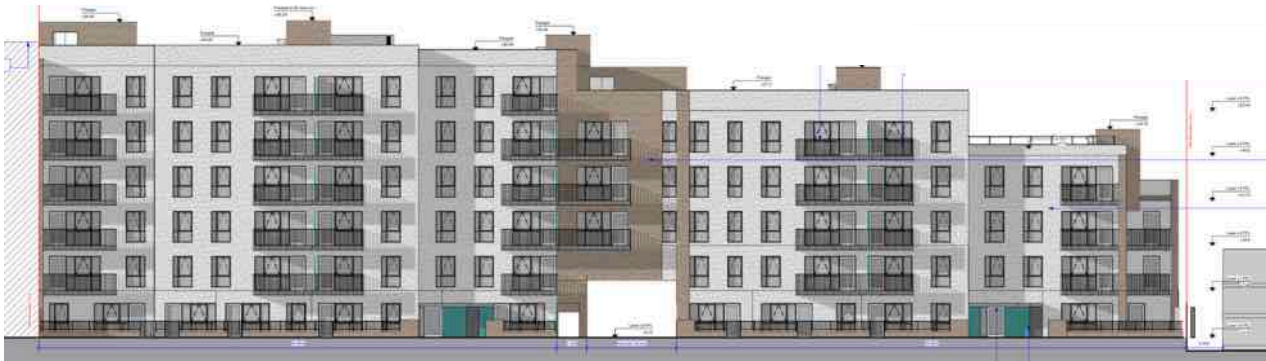
2. South Elevation to courtyard