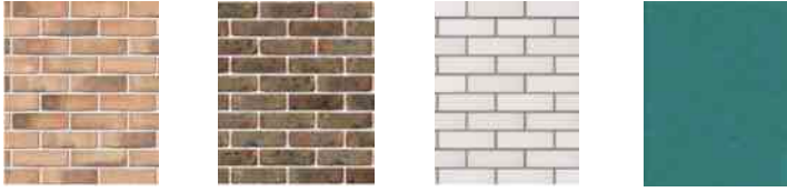
1. Clay bricks, mineral painted render