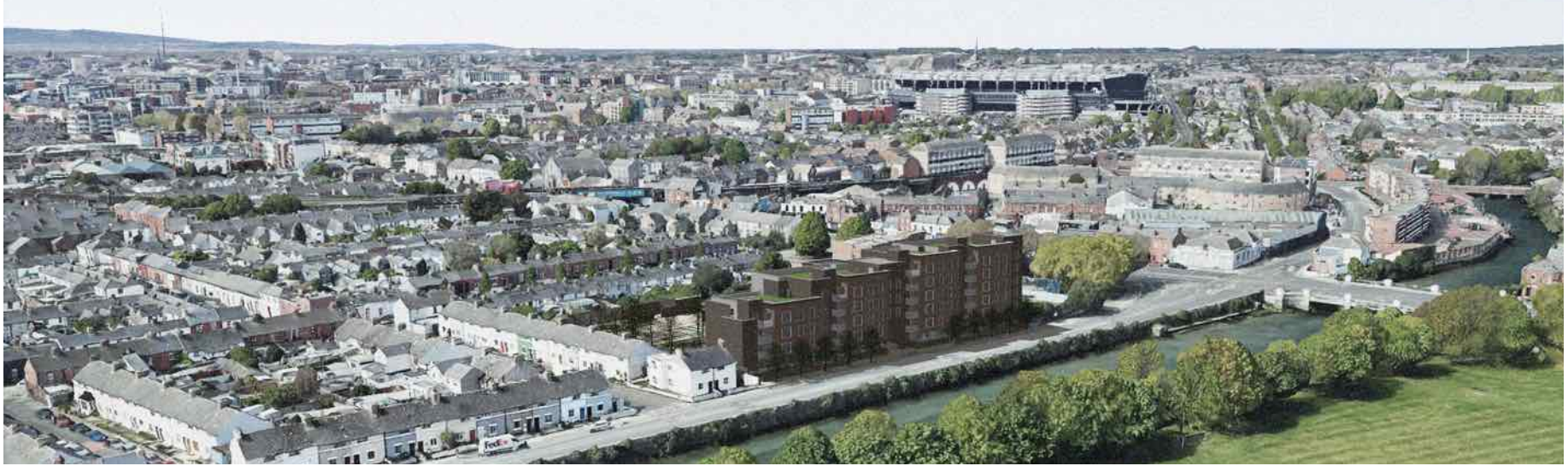
1. Birds eye view from north east