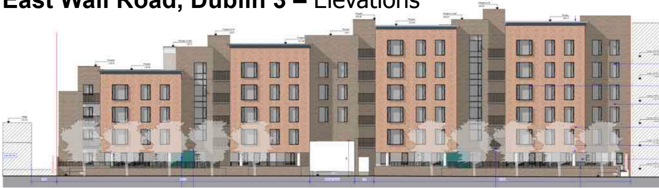
1. North Elevation to East Wall Road