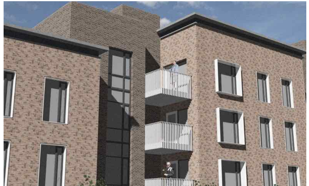
5. Balcony arrangement to East Wall Road