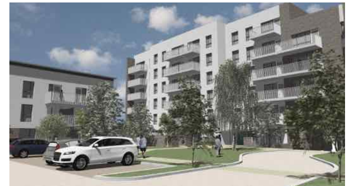
4. 3d view of courtyard