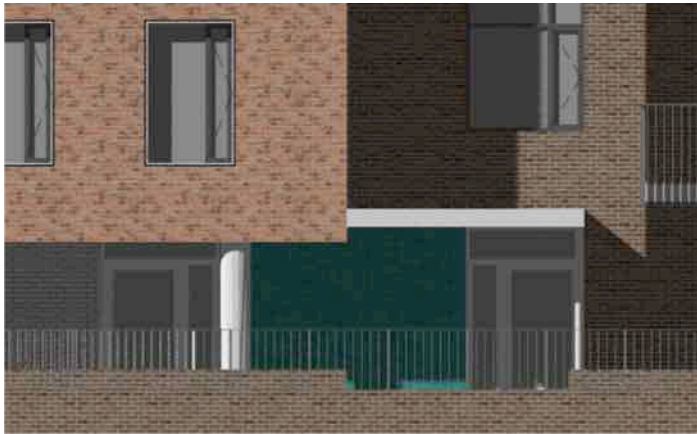
4. Elevation details to East Wall Road