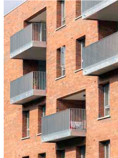
2. Precedent for balconies