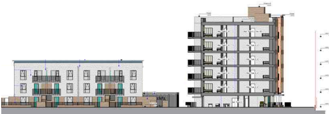
3. Duplex elevation to courtyard