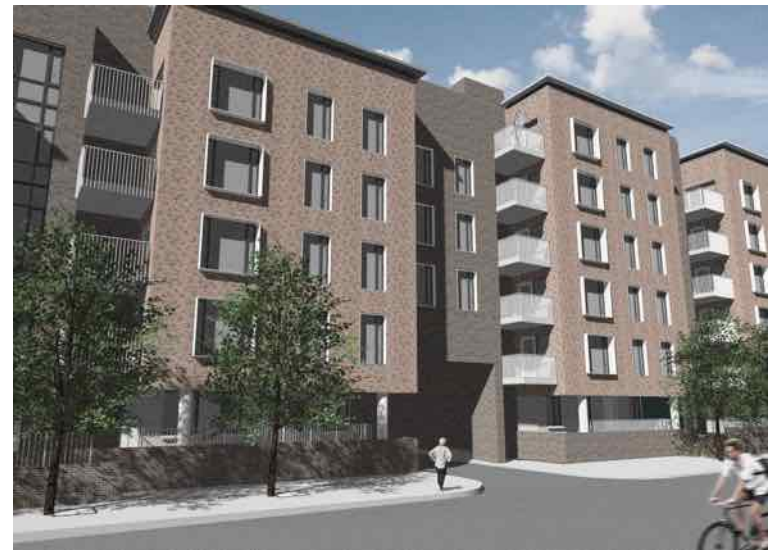
3. View from East Wall Road