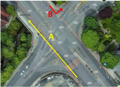
Problem A - this is the most urgent and dangerous one

Traffic coming towards Donnybrook and taking the left exit to Ranelagh continues straight RIGHT THROUGH the cycle lane which veers right (link 1 and link 2). Often cars do not wait for the cyclist, or often don't even understand that the cyclist is continuing straight. The cycle lane needs to be straight here and cover all of the left two turning lanes. Please consult with experts to solve this. Solving this problem is urgent. This is the primary school cycle route and I believe a fatality is likely here.