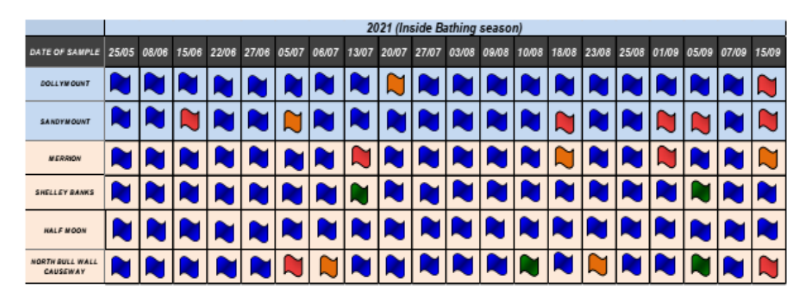
Figure 1 – Summary of 2021 bathing water results available online