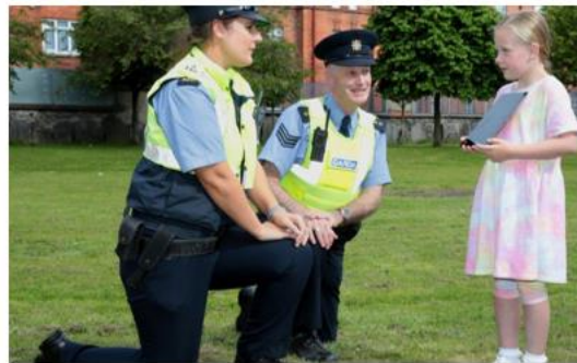
Connected Community Smart D8