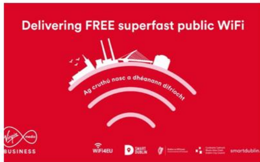
WiFi4EU & World WiFi day