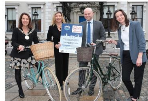
Sustainable Future Cycling Buddy App