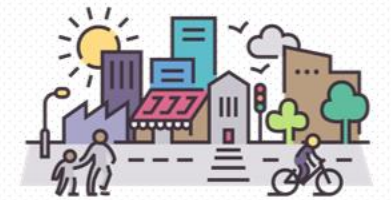
Academy of the Near Future