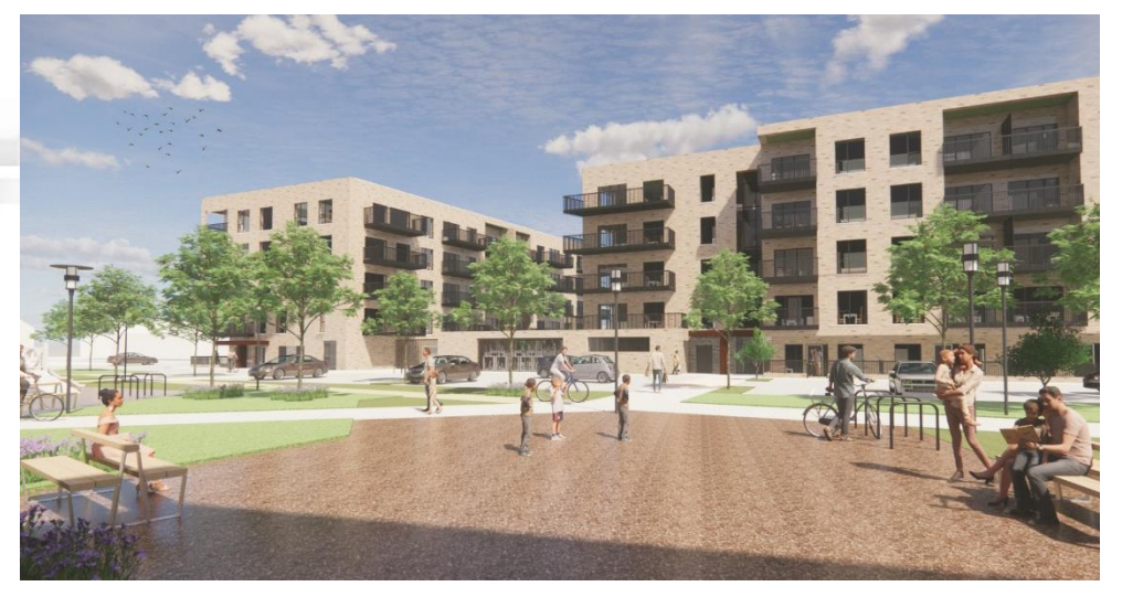
View onto POS