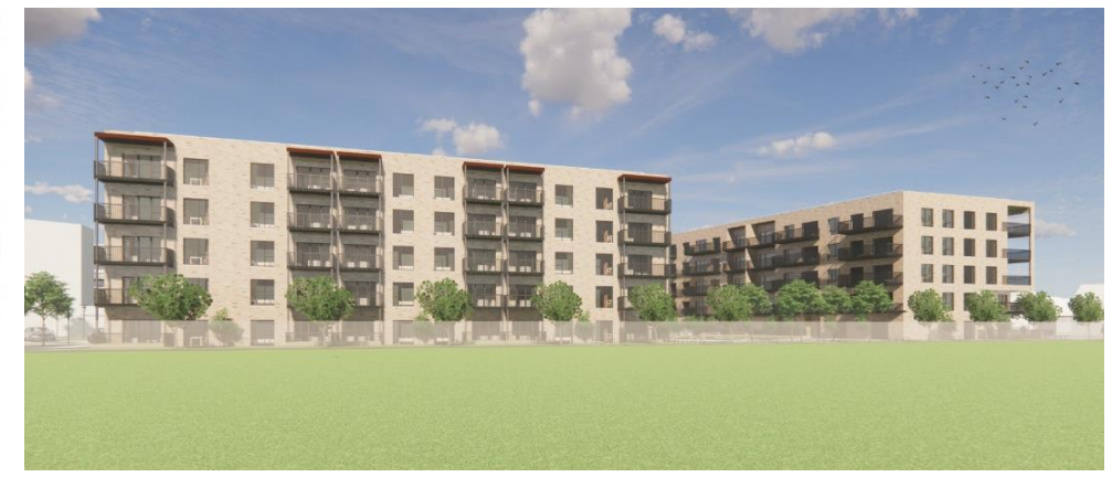
View onto GAA pitch