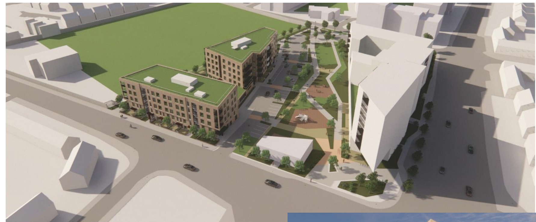
North West Axo View