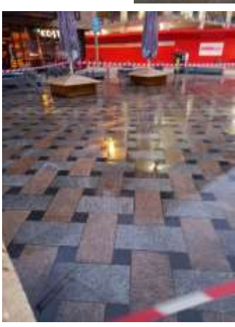
Before & after images taken at Smithfield Plaza