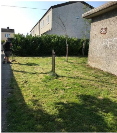
Laneway Shanliss Way