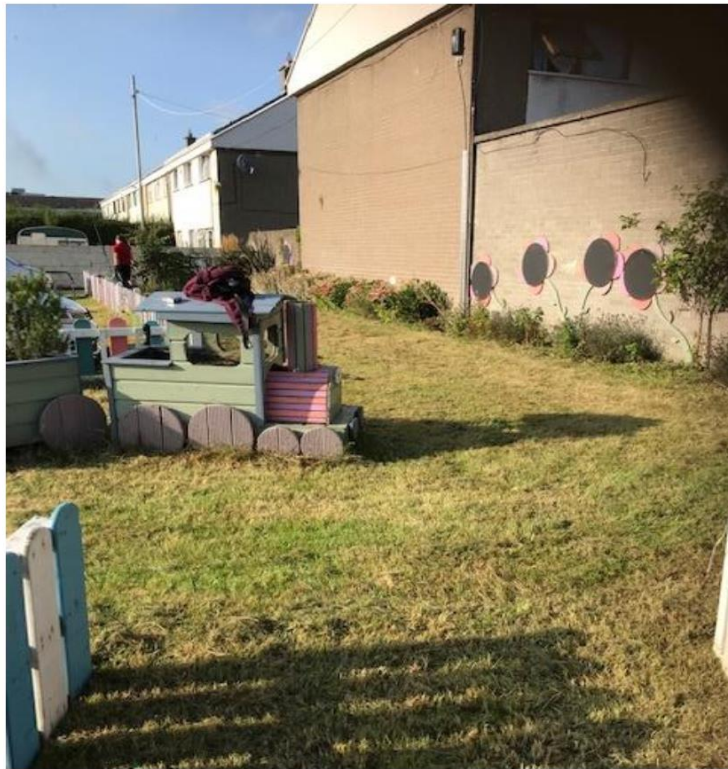
Our Lady's Nursery Sillogue