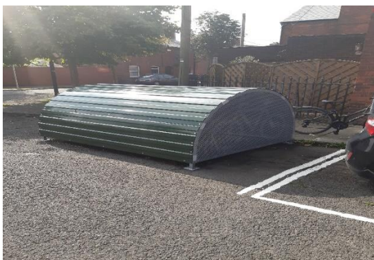
Type 2 - Fiethanger Bike Bunker in location on Primrose Ave.