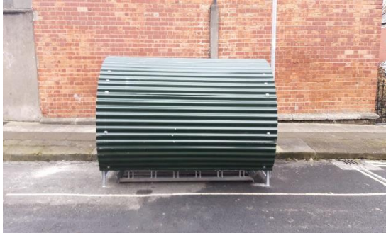
Type 3 - Cycle hoop Bike Bunker in location on Emor Street.