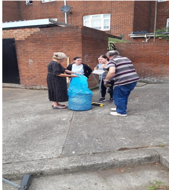
Cabra Park Residents Clean Up