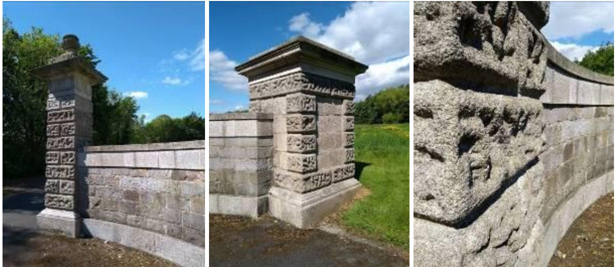
Detail of tall elegant gate piers to left topped with urns on a swag-enriched plinth, which sit on ornamental cappings with Doric enrichments and bucrania identical to those of the outer piers of the Griffin Gateway. The different materials used - limestone and granite clearly visible.