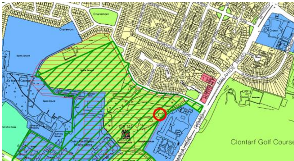
Fig.1: Site location and zoning map for the Northern Gateway. The location of the Northern Gateway is circled in red.