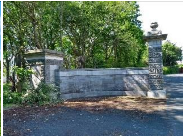
Views of northeast side of entrance gateway.