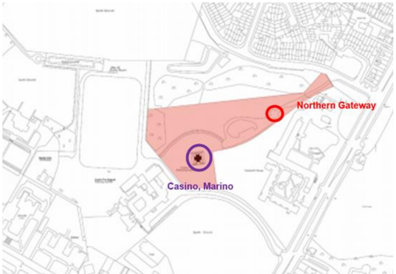
Fig.3: The current extent of the Marino Casino site highlighted in pink. This corresponds to the curtilage of the present site. The location of the existing Protected Structure (Marino Casino) is shown in purple and the (Northern Gateway) is shown in red.