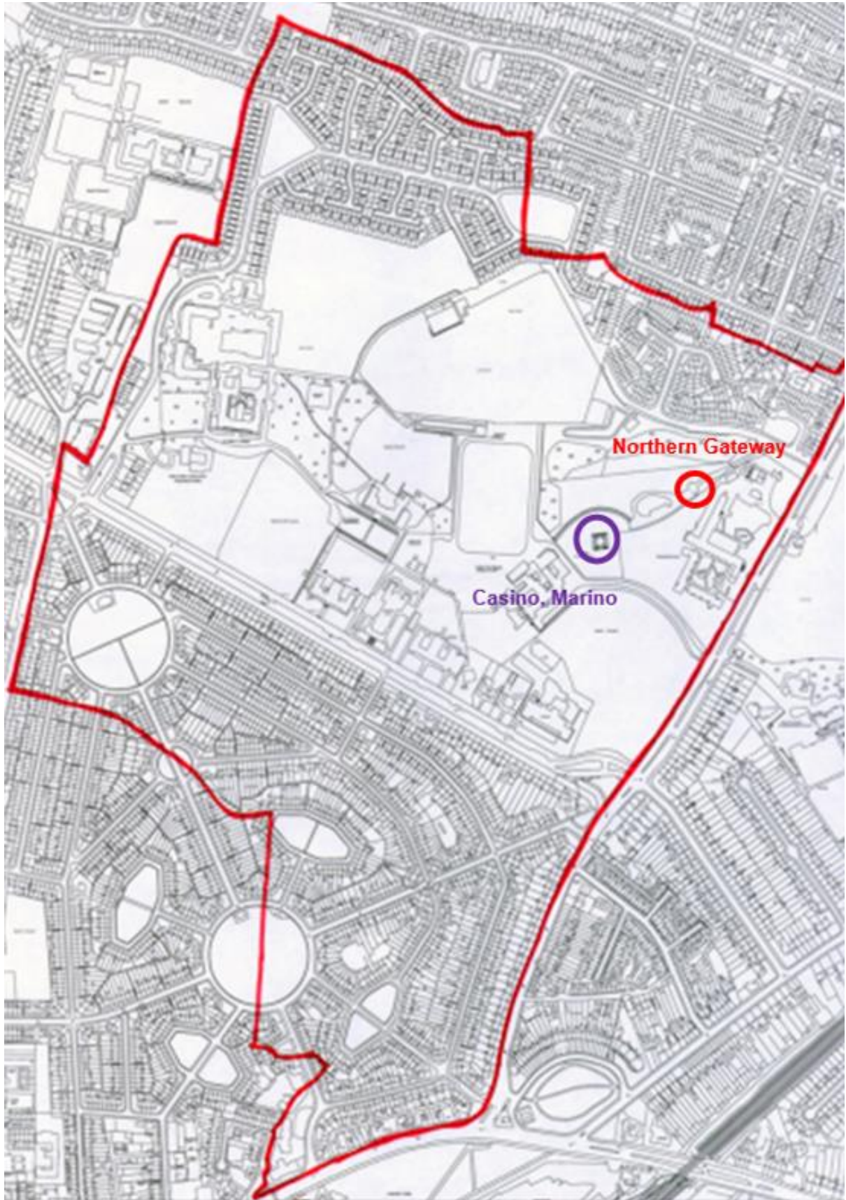
Fig.4: The original extent of the Marino Casino Demesne overlain on the 2006 OS map. The location of the Casino is circled in purple and the Northern Gateway is circled in red to the northeast of the Casino.