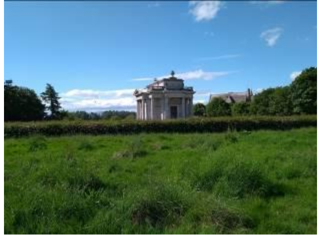
Views of limestone and granite Northern Gateway (left) located a short distance to the northeast of the Casino, Marino (right)