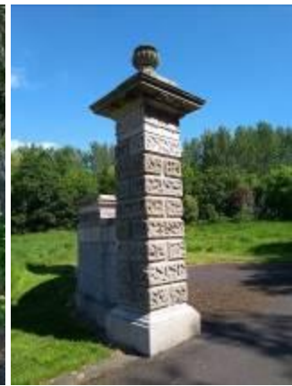
View of southwest side of Neoclassical Northern Gateway, with curving ashlar wall with tall elegant gate-pier and curving ashlar wall terminated by a squat, wide pier. Gate piers display vermiculated rustication.