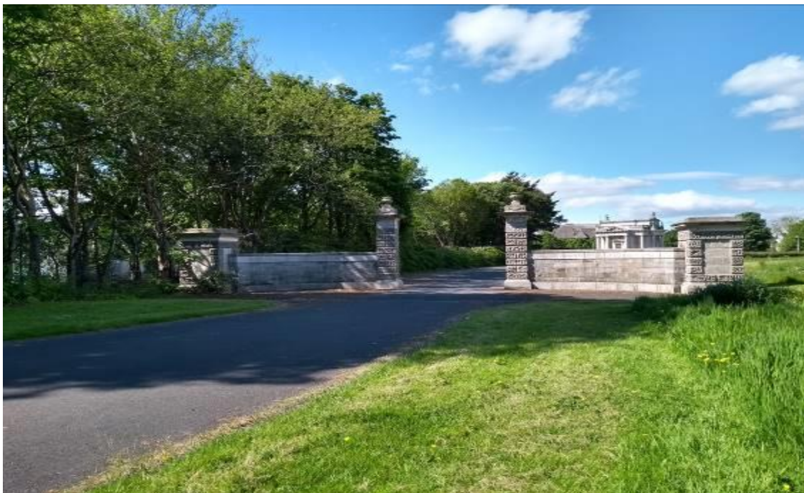
PHOTO OF STRUCTURE

Amendment of current entry on the Record of Protected Structures, Ref 4858, Malahide Road, Dublin 3 - The Casino, Marino to now read Malahide Road, Dublin 3 - The Casino, Marino, including Northern Gateway on Dublin City Council's Record of Protected Structures, under Section 54 and Section 55 of the Planning & Development Act 2000 (as amended).