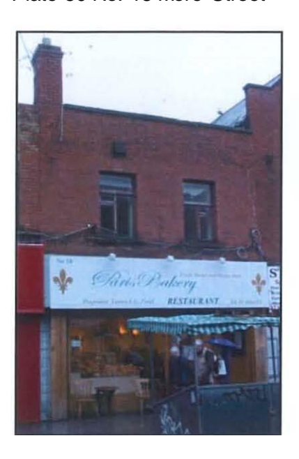
Plate 50 No. 18 More Street