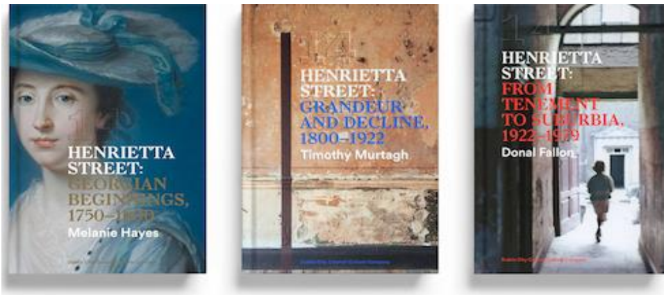
Three books recently commissioned and produced by the Culture Company, for 14 Henrietta Street.