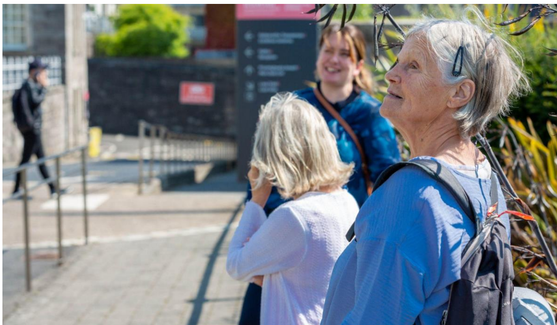
A biodiversity walk at the National Museum of Ireland, as part of Culture Club, signals the gradual return of in person activities.