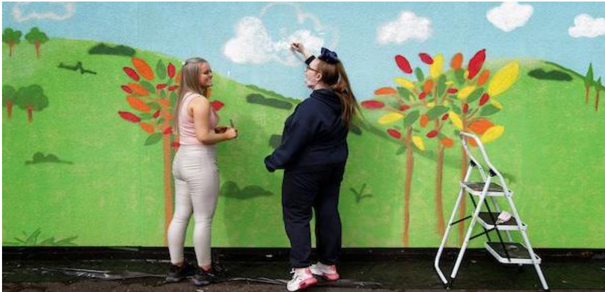
Transition year students at Clogher Road Community College, Crumlin make the finishing touches to their new school mural, created as part of Culture Connects @ Richmond Barracks.