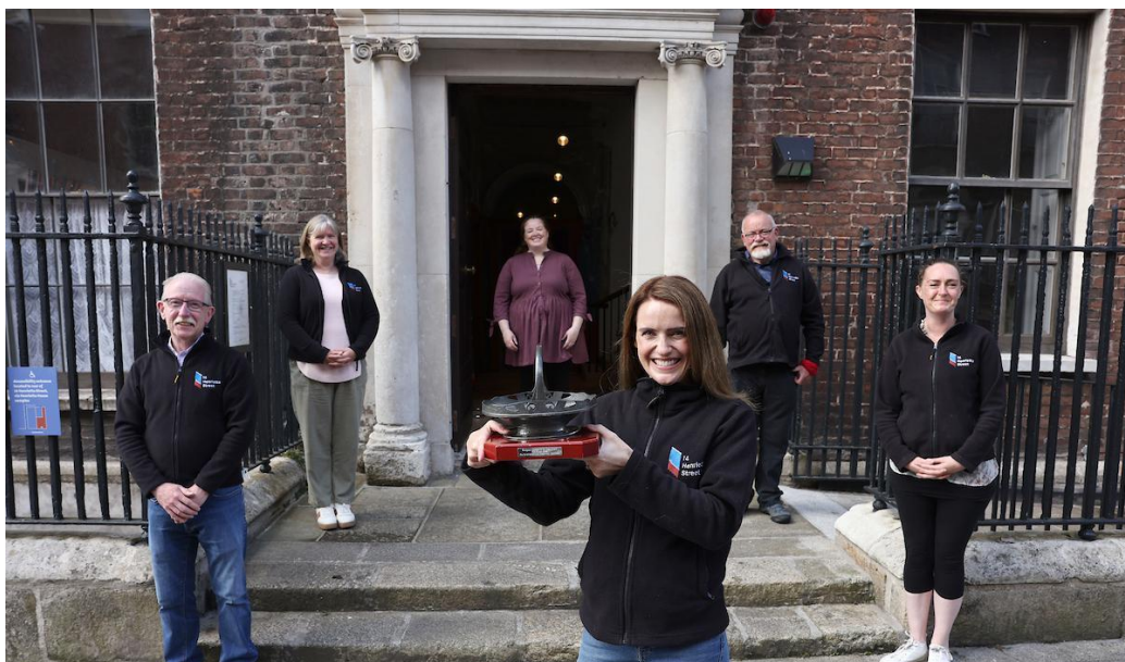
The team at 14 Henrietta Street with the Siletto Award, presented to the museum at the European Museum of the year awards in May.