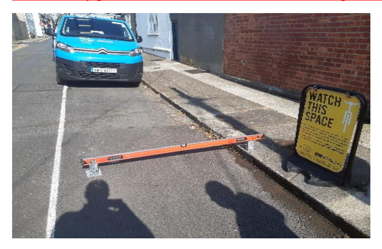
Street survey prior to installation.

Street survey prior to installation. Note "Watch this space sign"