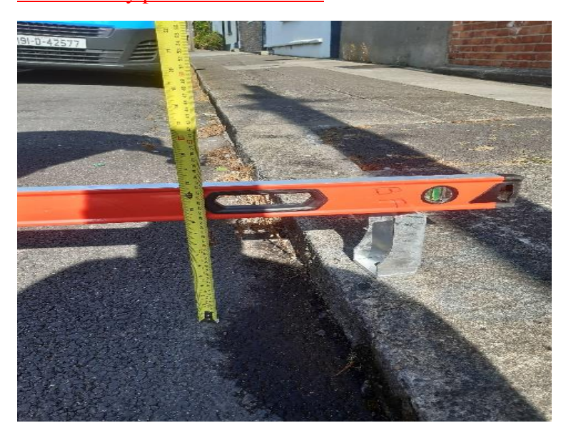
Bike Bunker – St Albans Road pre installation.