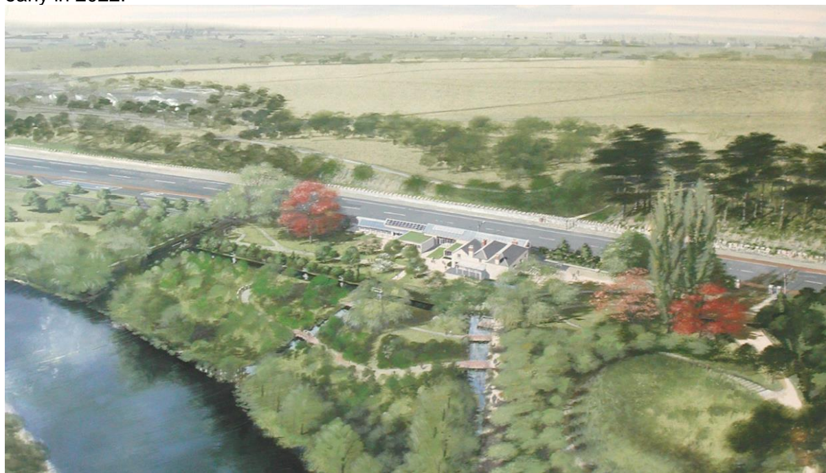
Artists impression showing Liffey Vale proposal, set between the Phoenix Park and the Liffey

Following further consultation in the coming weeks with a range of stakeholders including community representatives, Parks will develop further the design, before progressing with formal notification of a Part 8 application in the coming months. Works are scheduled to begin early in 2022.