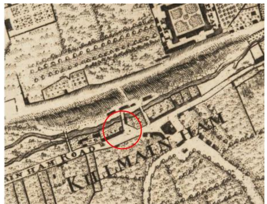
Fig. 9: Extract from Rocque's Map of the city of Dublin and environs, 1757, location of subject structure outlined in red.