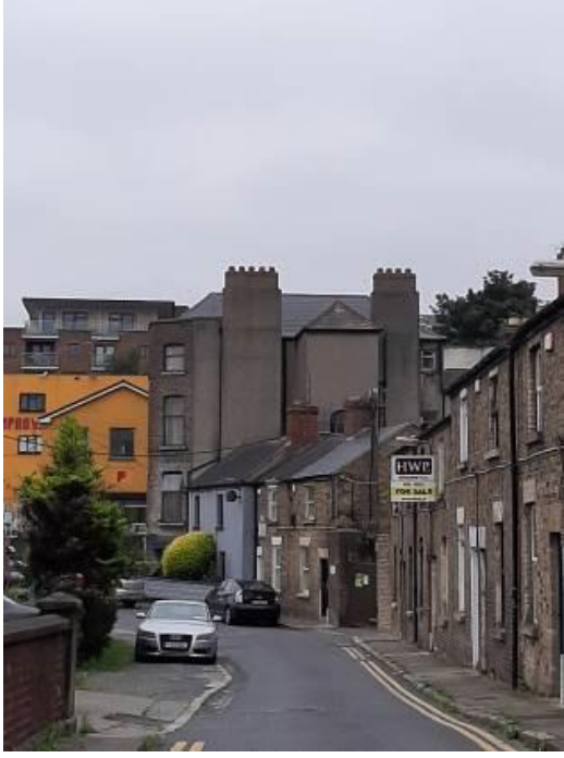
Fig. 6: Site context from north showing twostorey early twentieth houses to Kearns Place