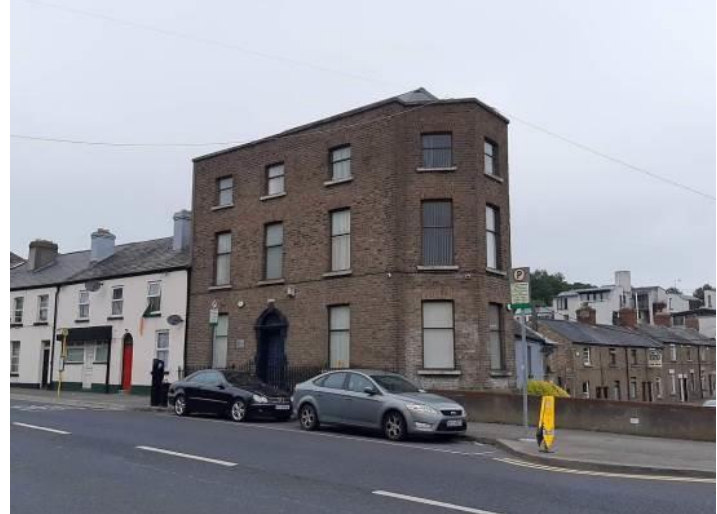
Fig. 4: Site context from southeast.