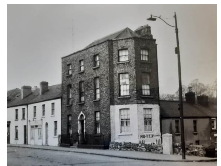
Fig. 5: Archive photograph of No. 31 Old Kilmainham.