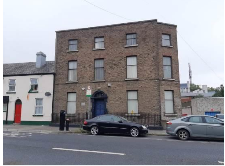
Fig. 3: Front (south) elevation.