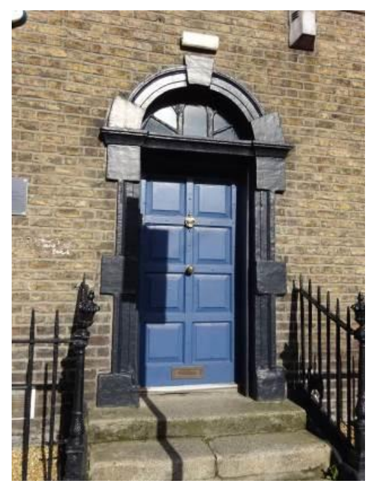
Fig. 7: Block-and-start doorcase to front elevation.