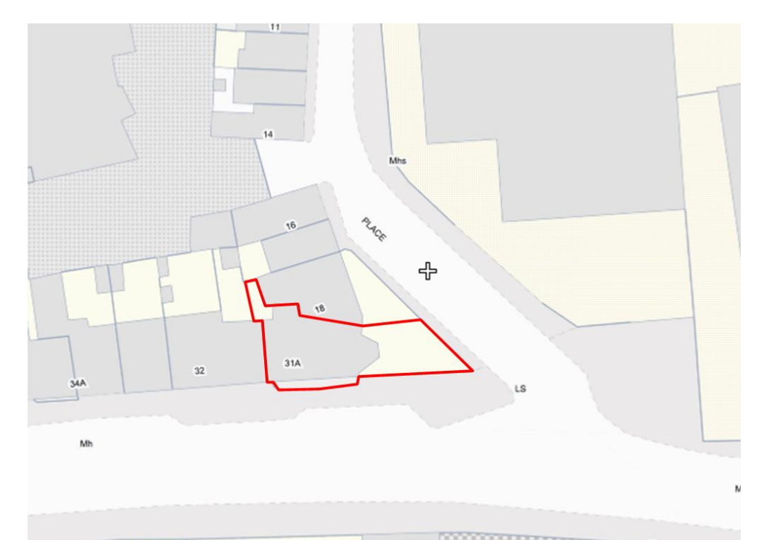
Fig. 2: No. 31 Old Kilmainham, Dublin 8, extent of Protected Structure status and curtilage outlined in red.

The proposed protected structures and their curtilage are outlined below in red. The curtilage extends to the boundaries as shown on the map below.