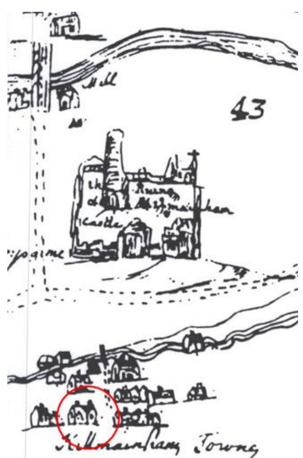
Fig. 8: Kilmainham Down Survey Map c.1655-56 by Robert Girdler, suggested location of subject structure outlined in red.