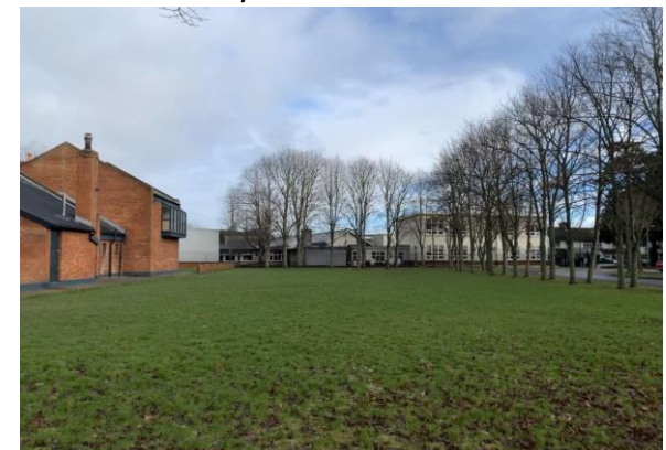
View – North/East