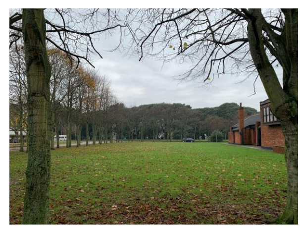
View – South/West