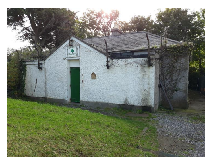
Access to Clubhouse