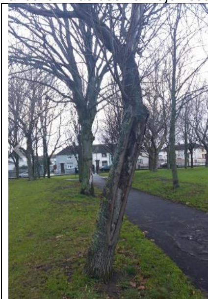
Lime tree. Tree Number 01K8

The inventory has uncovered 36 trees with large cavities associated with extensive decay and leading to dieback and decline. The origins of the wounds are not clear but it is likely that vandalism has been a major issue.