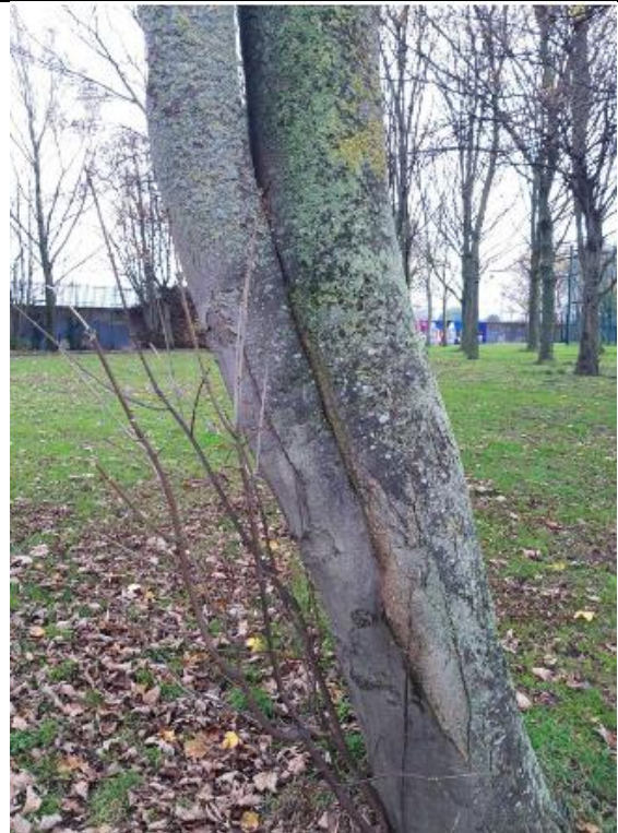
Norway maple. tree number 01HV