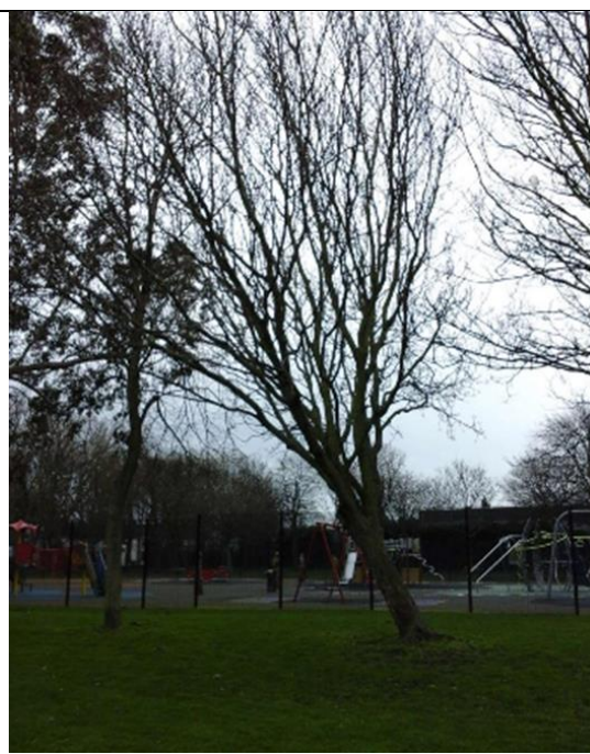
Sorbus aria with severe lean beside playground Tree Number: 01AL