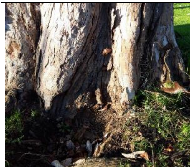
Basal wound and Ganoderma brackets