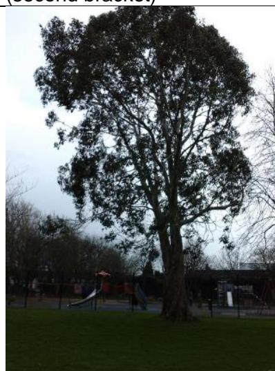
Tree with compression fork, codominant stems, basal wound, and fungi beside playground.