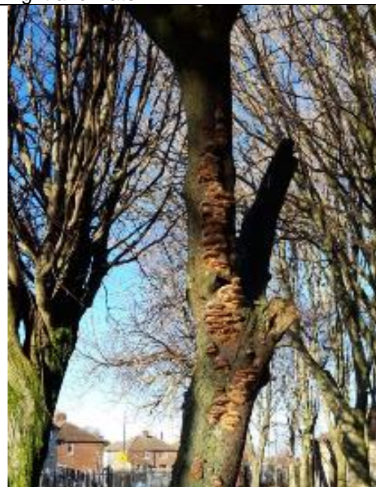
Prunus cerasifera nigra : Tree 01KH