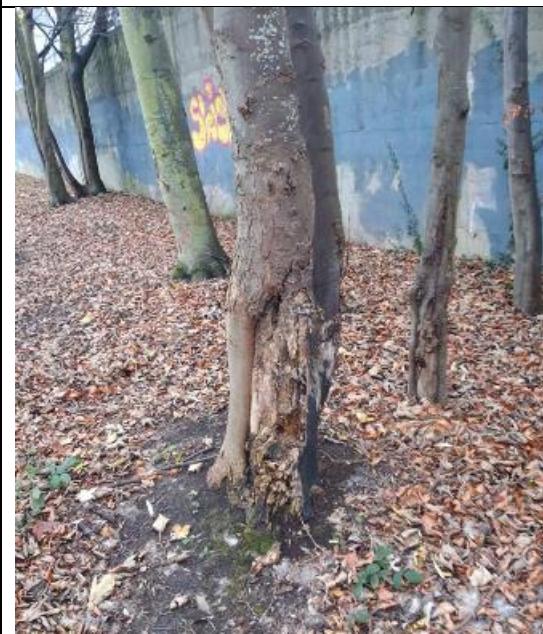
Beech tree. Cavity with extensive decay. Tree number 01J7