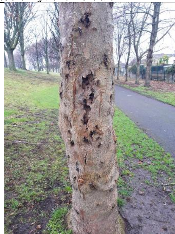
Ash Tree. Number 01KR