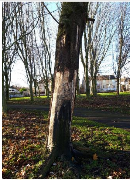
Norway maple tree: Tree number 01KL