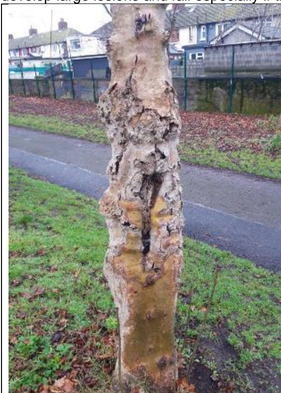
Ash Tree. Number: 01KP

3 Fraxinus excelsior (Ash Trees) will be removed due to a disease called Bacterial Canker of Ash. It is caused by the bacteria Pseudomonas syringae ssp. savastanoi pv. Fraxini and it is not related to Ash Dieback disease. Previous wounds are invaded by the pathogen which develops into lesions that may exude a sticky fluid. Over time the bark dies and peels back. In some cases, trees with Bacterial Canker live for many years and be hardly affected; others develop large lesions and fail especially if the lesions ring the trunk or branch.