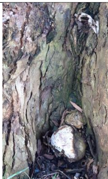
Immature form of Ganoderma australe (second bracket)