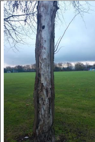
Lime tree. Tree number 01K5