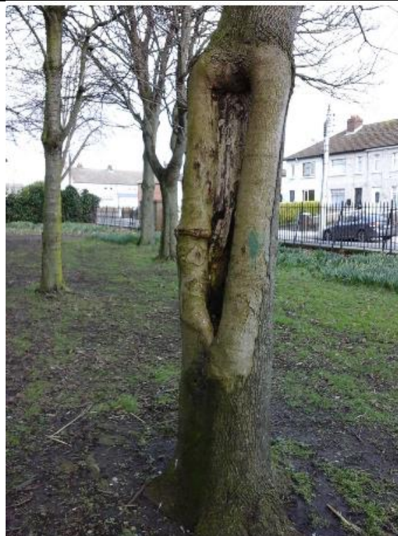
Norway maple with large cavity and decay due to compression fork failure during high wind Tree Number 01HS