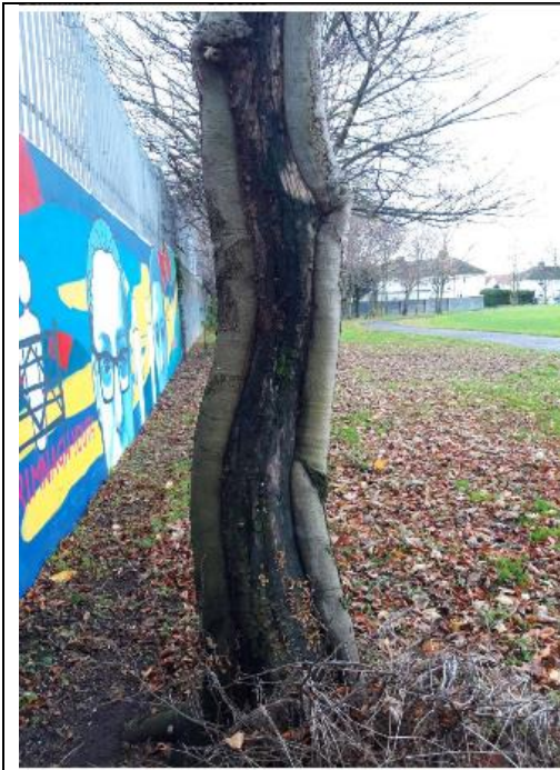
Beech tree: tree 01J0