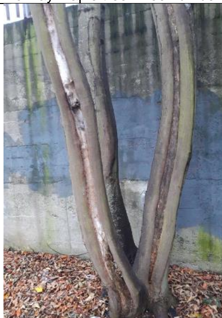
Beech tree. Tree Number 01J5