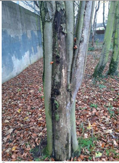
Beech tree: tree 01J3