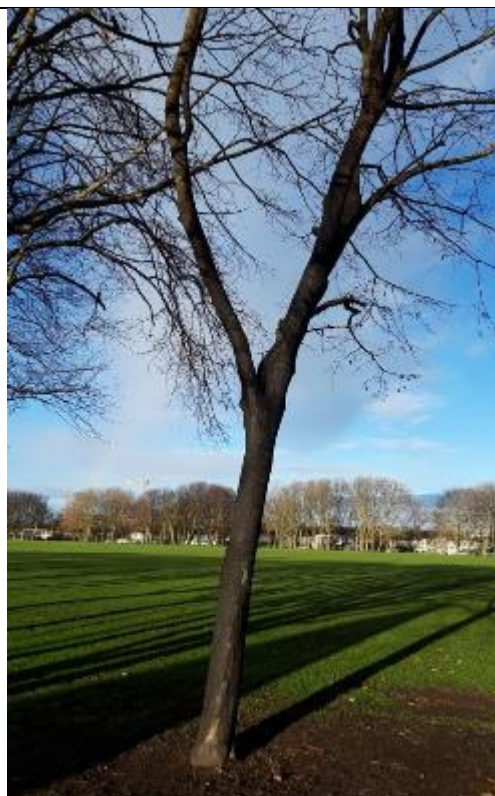
Lime tree, entirely scorched. Tree Number 01KA