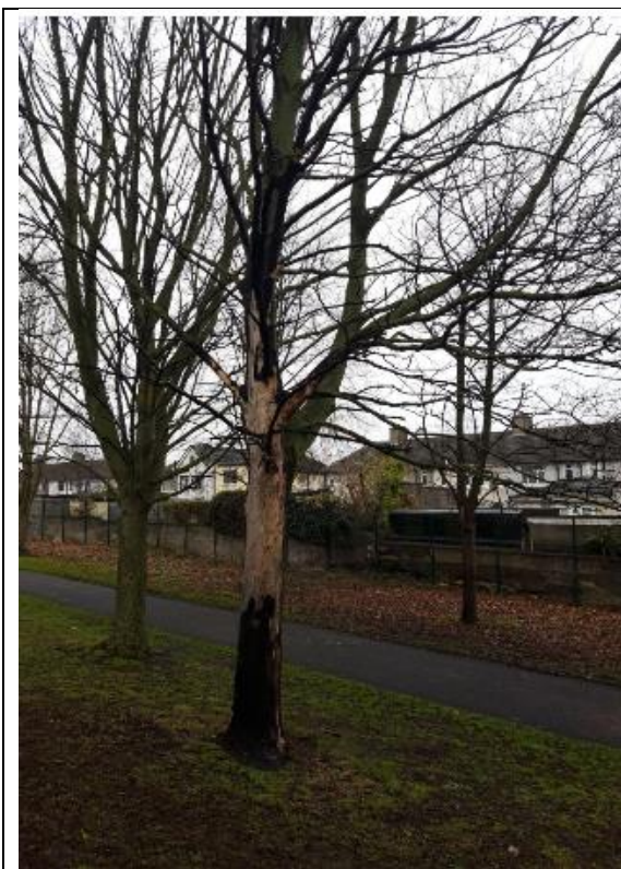
Norway Maple Extensive damages due to fire. Tree Number 01KS