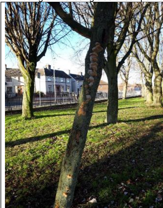
Prunus cerasifera nigra . Tree 01KJ

The inventory found 6 dying trees, notably 2 Prunus cerasifera nigra with fungal infection ( Phellinus pomaceus ). The reason for the decline of the other 4 trees is likely to be due to them being on the losing side of competition for light and water.