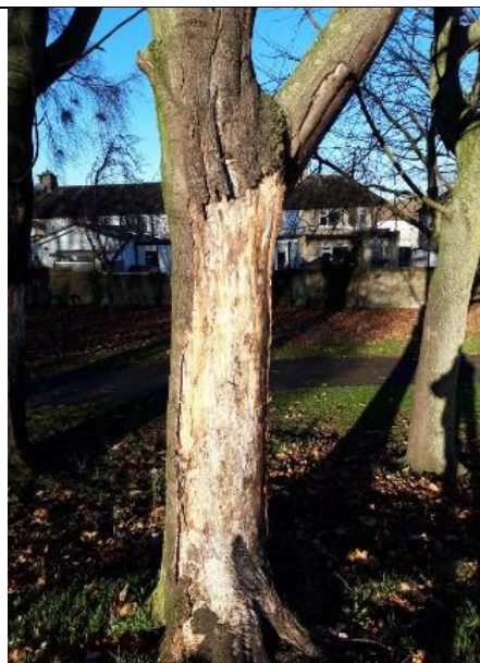
Norway Maple. Tree Number: 01kM