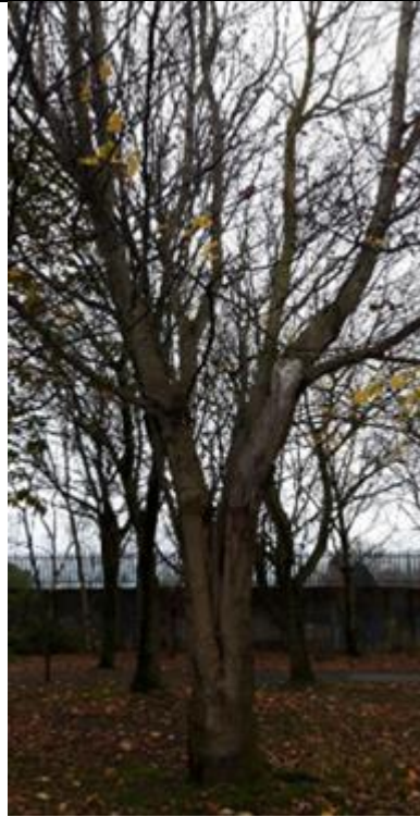
Large Norway maple splitting in 2. Tree Number 01HZ