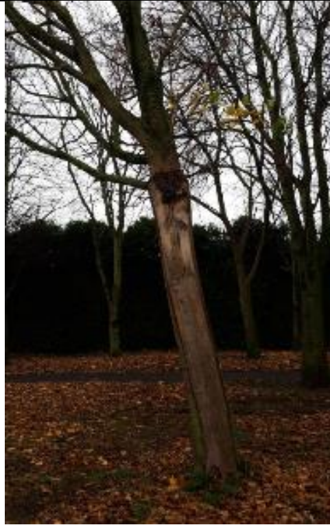
Norway maple has broken in 2 when compression fork failed during high wind Tree Number 01HS