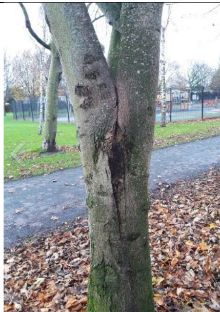
Norway maple with compression fork starting to split. Tree Number 01HP