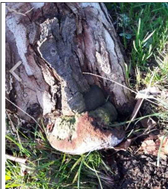
Ganoderma australe (first bracket)