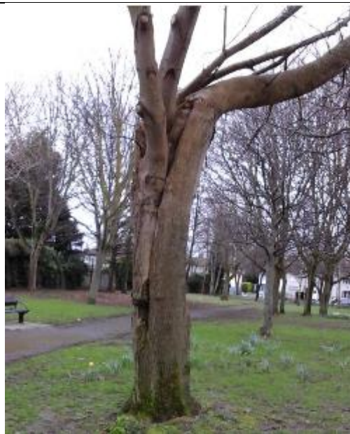
Norway maple compression fork failure. Tree Number 01Ak