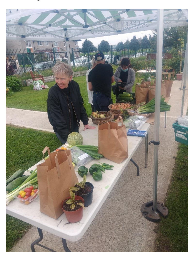
South Central Area Committee Wednesday 20th January 2021

34 Entries to Area based competition. All entries awarded a prize. This year One4All Vouchers and Certificates of achievement were distributed to groups participating in the competition thanks to funding from the Litter Management Office. New entrants supported by Community and Public Domain. Gray st, The Tenters, The Four Terraces, Clanbrassil Close, Rialto Cottages, Stillgarden ,Frontline bikes all based in the SWIC. Noteworthy winners: Camac Park – regular Clean ups, planting and weeding. Cherry Orchard Community Garden composting manure from the Equine Centre and selling local produce to residents and cafes based in the area. Bluebell Environmental Group shared joint 1<sup>st</sup> Inchicore Environmental regular clean-ups, weeding, planting and environmental initiatives. Stillgarden for transforming the entrance to Goldenbridge Industrial Estate.