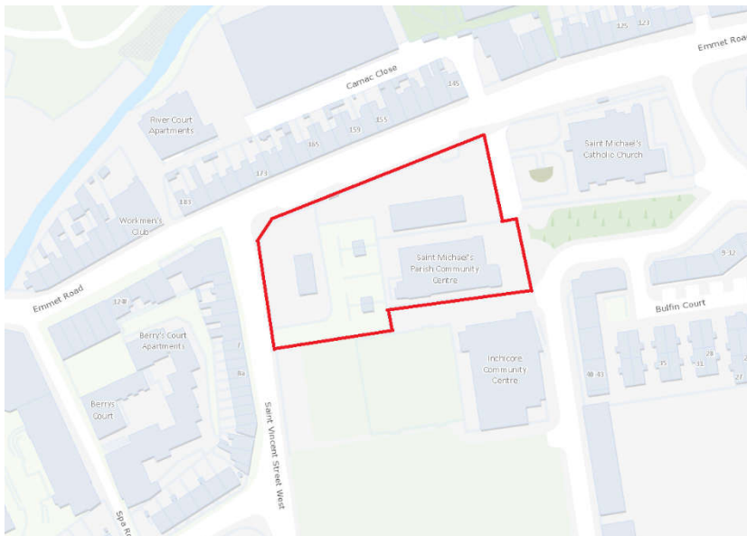
Location of site showing demolition proposal within red line

The portion of the site included in this application covers an area of approx 6110 m 2 , and is located on Emmet Road, Inchicore, between St Vincent Street West and St Michael's Church.