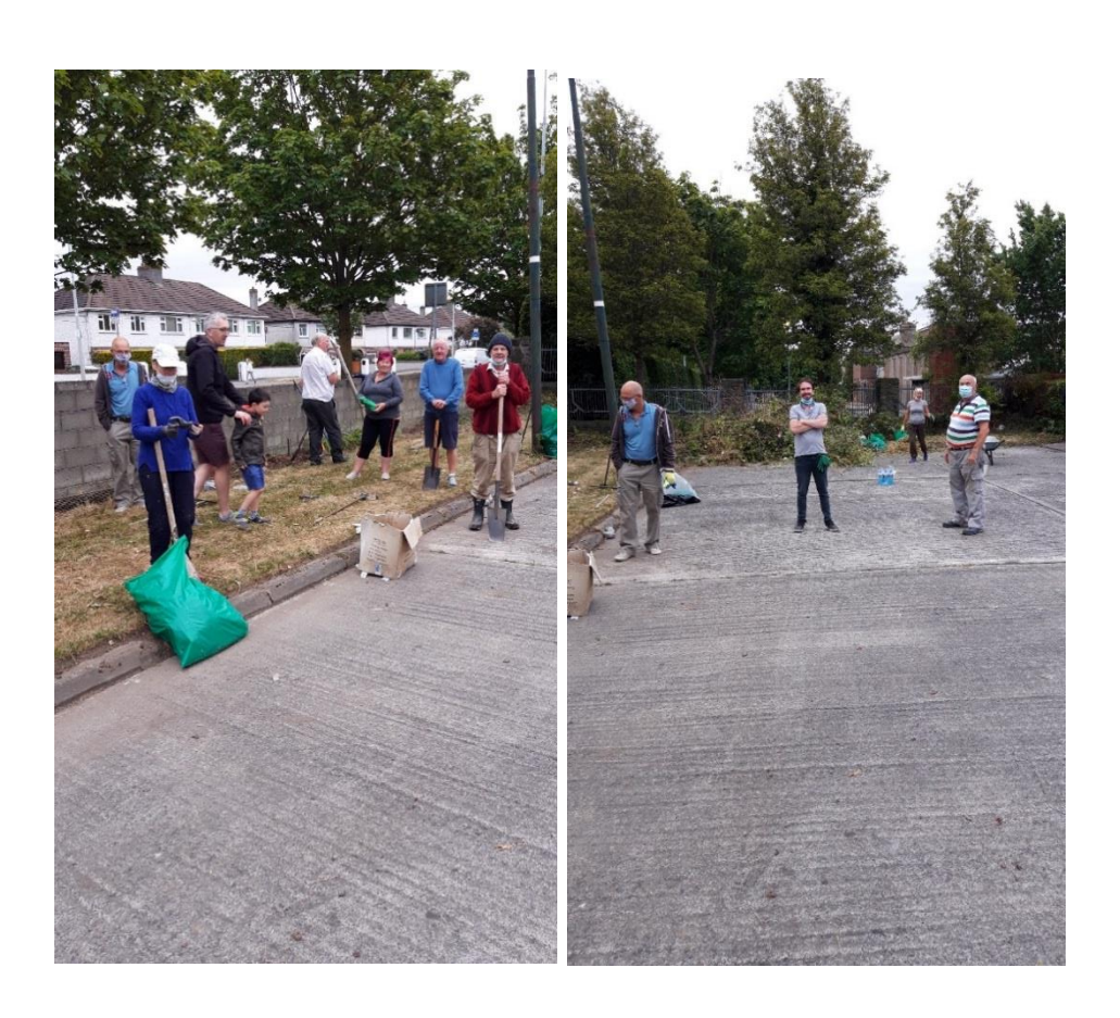
Navan Road. Cleanup at Darling Estate, Navan Road.

This is a new very active residents group.