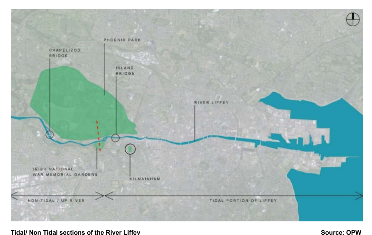
Tidal/ Non Tidal sections of the River Liffey

The Phoenix Park runs along the opposing, north bank of the river. The Chapelizod Road (R 109) separates the north bank of the River Liffey from the Phoenix Park. This two-laned road is relatively straight and flat with pedestrian pavements on both sides and with cycle lanes in part.