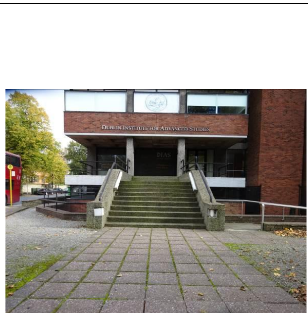
10 Burlington Road, Dublin 4, entrance