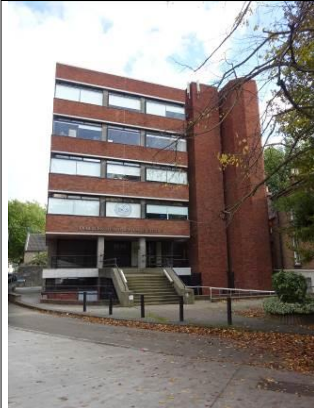
10 Burlington Road, Dublin 4, front (east) elevation.