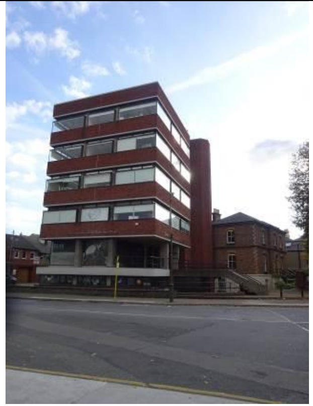
10 Burlington Road, Dublin 4, north elevation