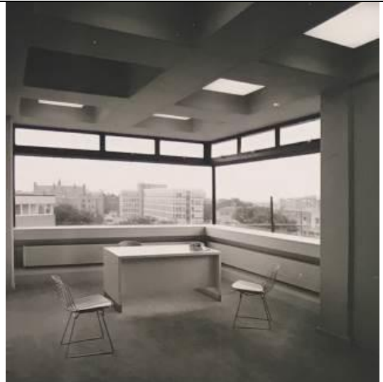
Ref: 73_21