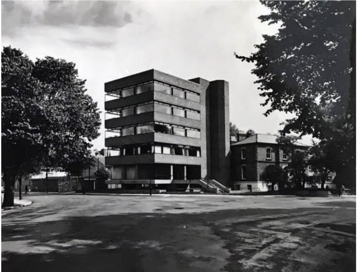
Irish Architectural Archive, Ref: 73_21. Mounted photographs relating to Dublin Institute for Advanced Studies, 10, Burlington Road