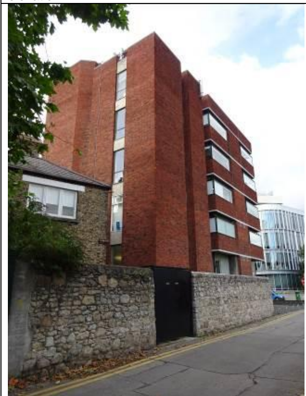
10 Burlington Road, Dublin 4, west elevation and rear boundary wall