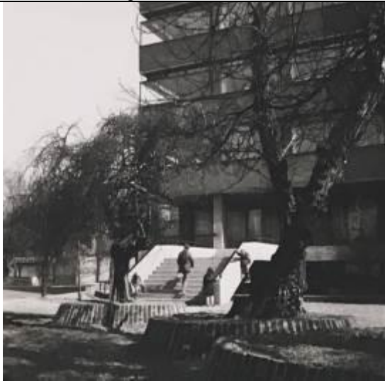
Irish Architectural Archive, Ref: 73_21