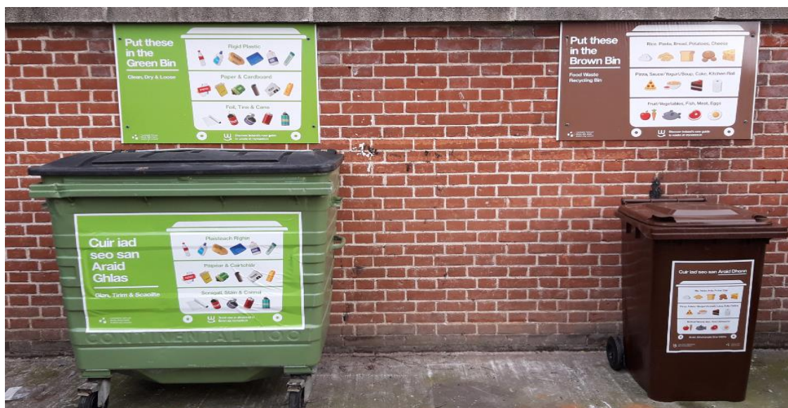
Figure 1 : Wall signs for green and brown bins

When the bins arrive at each complex, residents are invited to a recycling workshop held at a convenient nearby location. Workshops are delivered by a recycling ambassador from the environmental charity Voice Ireland . At these workshops, best practice recycling is explained and residents have an opportunity to ask questions. Reusable recycling bags, a 10 Ltr food caddy and a roll of compostable bags are given to each resident at the workshop and available on request thereafter for residents unable to attend a workshop.