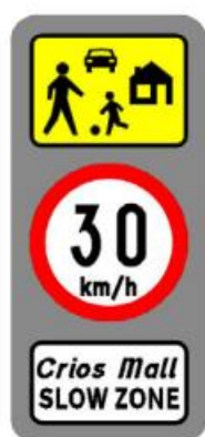
Sign F 403: 30 km/h Slow Zone

In regards to the height and position of the existing 30 km/h slow zone signs, Dublin City Council has used the guidelines set out in "Guidelines for Setting and Managing Speed Limits in Ireland" and "The Traffic Sign Manual" Chapter 4.