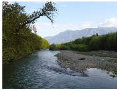
Region of Sterea Ellada Read more >