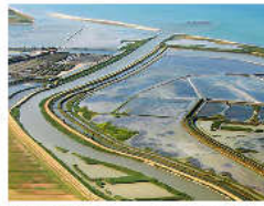
Po Valley (Panaro river, Comacchio valleys, Reno, Emilia Romagna coastal area) Read more >