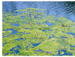
Lake Puruvesi (416 km 2 ) in Eastern Finland between South-Savo and North-Karelian regions Read more >