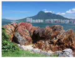
The Hong Kong New Territories (4,45 km 2 ), a region between two major urban areas of Hong Kong and Shenzhen Read more >