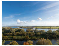
Dodder River Read more >