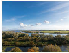
Biosphere Reserve 'Niedersächsische Elbtal' (Lower Saxonian Elbe Valley) Read more >