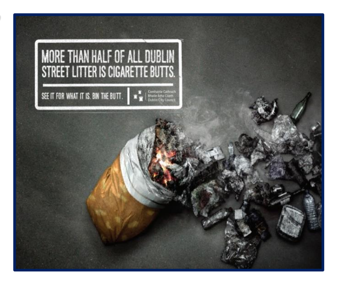
Link to Campaign Video