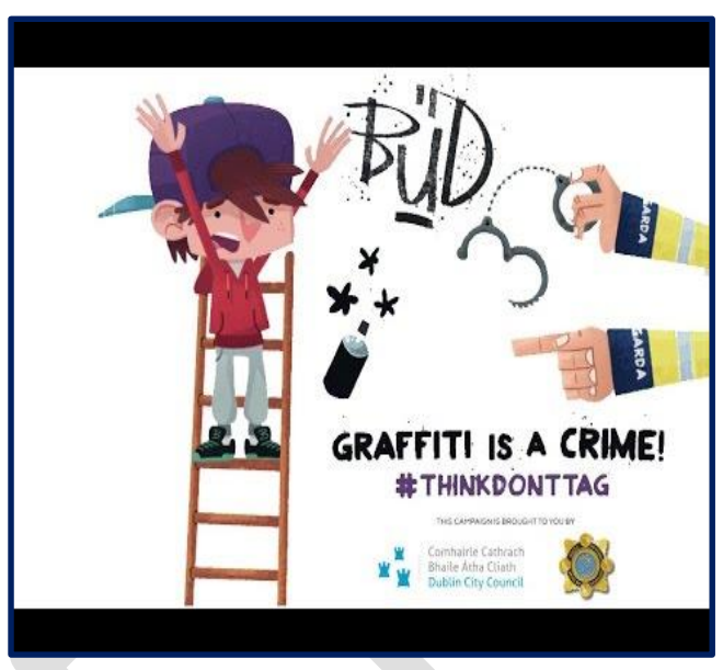
Link to Campaign Video

In 2018 Dublin City Council removed 17,000 m<sup>2</sup> of graffiti from public and private property in the city.