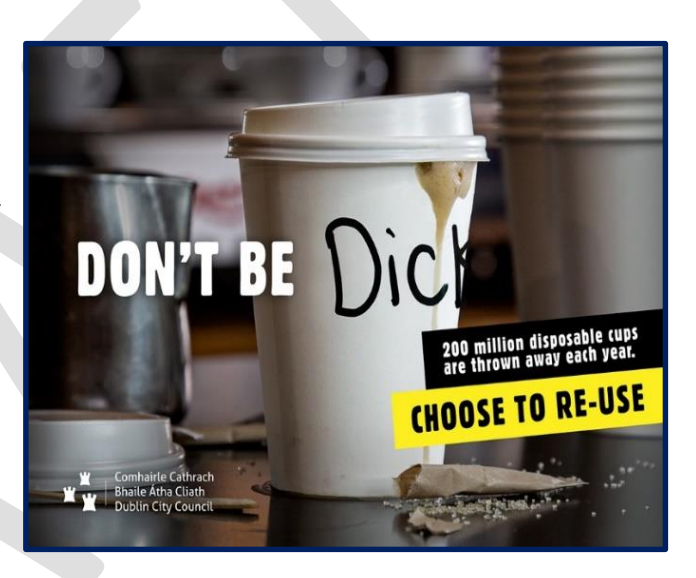
Link to Campaign Video

Cigarette butts account for nearly 60% of all the incidences of street litter in Dublin city. The aim of the City Council's campaign was to raise awareness among smokers that cigarette butts are litter and the significance of cigarette litter in the city.