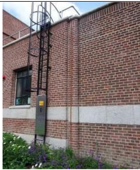
Curved brick to original southeast corner of turbine hall