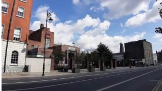
View of Power Station from southwest