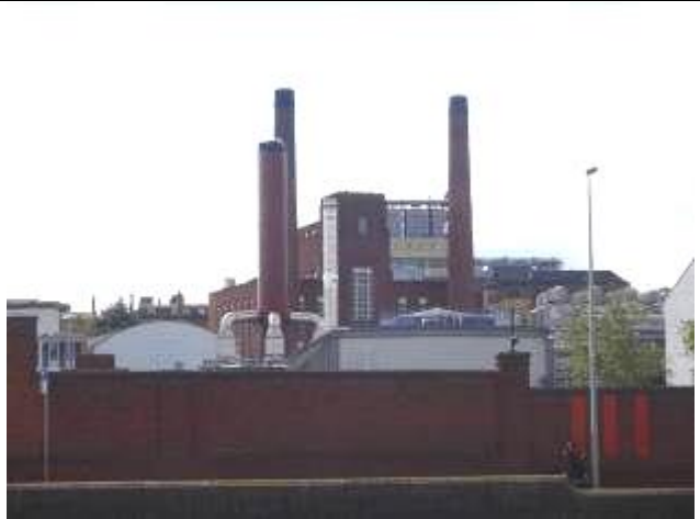
View of Power Station from Wolfe Tone Quay to the north