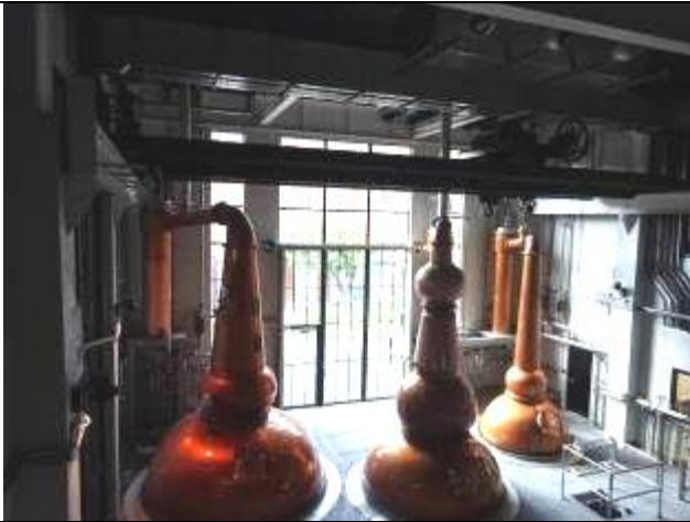
View of turbine hall looking south with distillery equipment installed