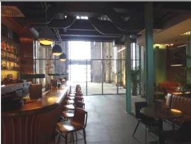
View of Power House Bar looking north