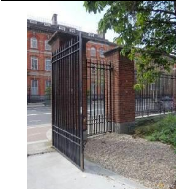
View of gate and gate piers