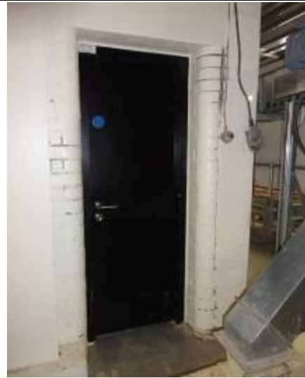
Door opening at lower ground floor level with curved brick forming reveals