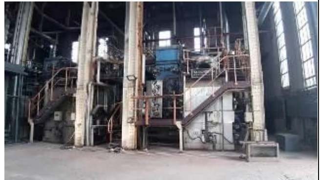
Machinery to interior of boiler house