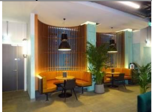
Control panels to boiler house incorporated into furniture within bar