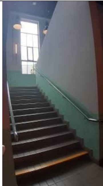
View of stairs from ground floor