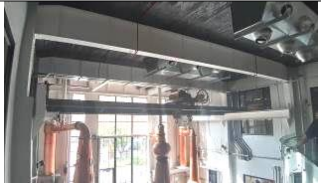
View of gantry crane to turbine hall from northeast