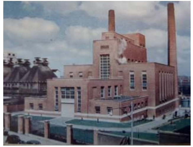
Image of Power Station dated 1959 from The Guinness Harp Bicentenary Issue 1759-1959 ; note the coal conveyor and copper roofs have been removed and the structure above the Boiler House is no longer clad in copper.