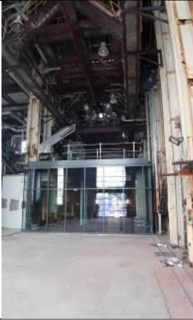
Boiler House looking south showing box for bar inserted to space