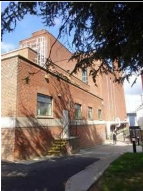
East elevation from southeast