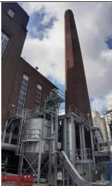
Chimney from northeast