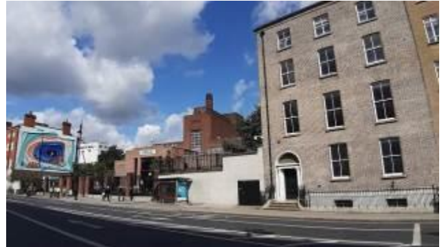
View of Power Station from southeast