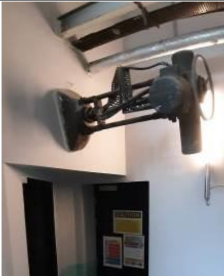
Valve at entrance to tunnel beneath James's Street