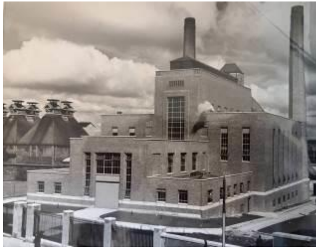
Power House, St James's Gate Brewery, Dublin 1946-9. This image, taken shortly after the building's completion, shows the copper roofs to the upper sections and the coal conveyor to the rear of the Boiler House.

and visitor centre for Roe & Co. Under this project, an extension was constructed above the 1983 western extension, behind the 1990 dummy wall.