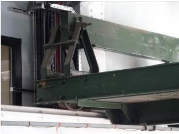
Detail of section of gantry crane