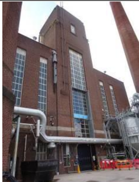
North elevation from northeast