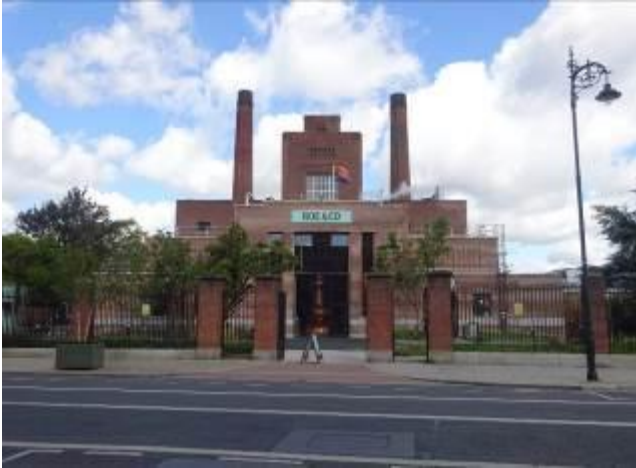
View of Power Station from south