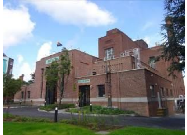
South elevation from southeast