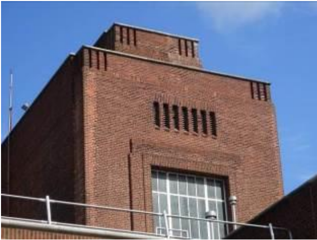
Brick detail to south elevation of boiler house