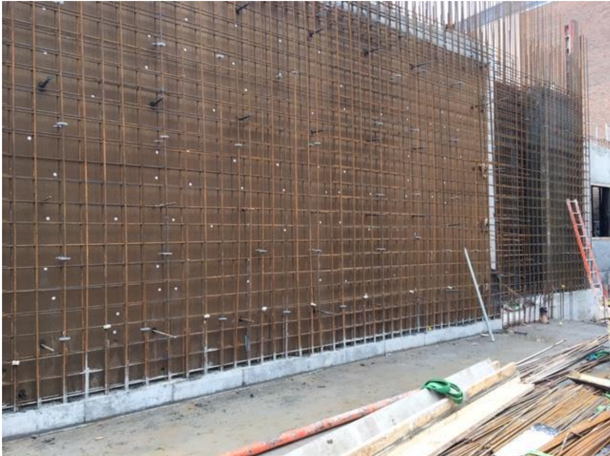
Ground – 1st Floor walls been cast at GL 25b in Corner Building