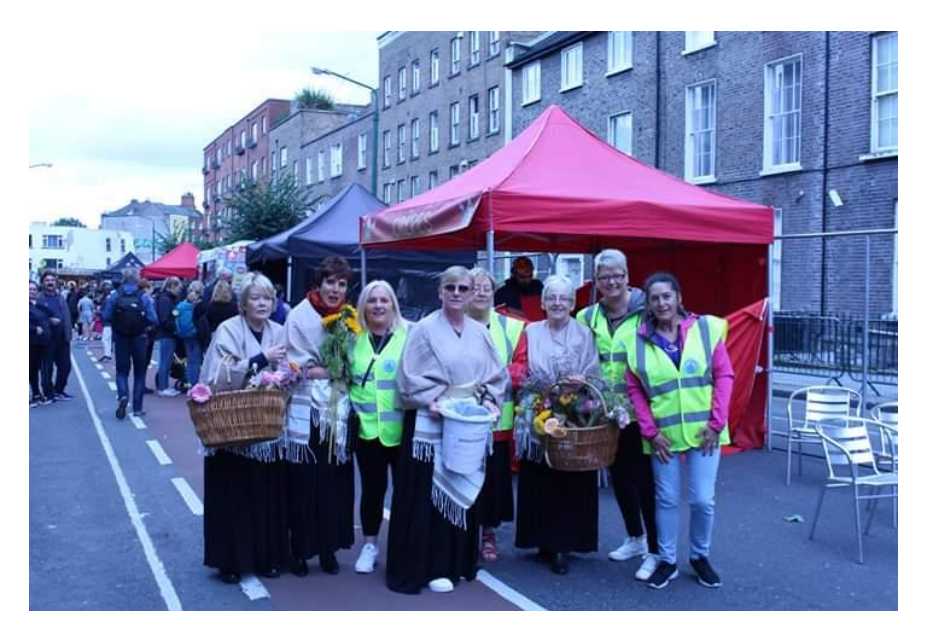
Dorset Street / Blessington Street Festival.