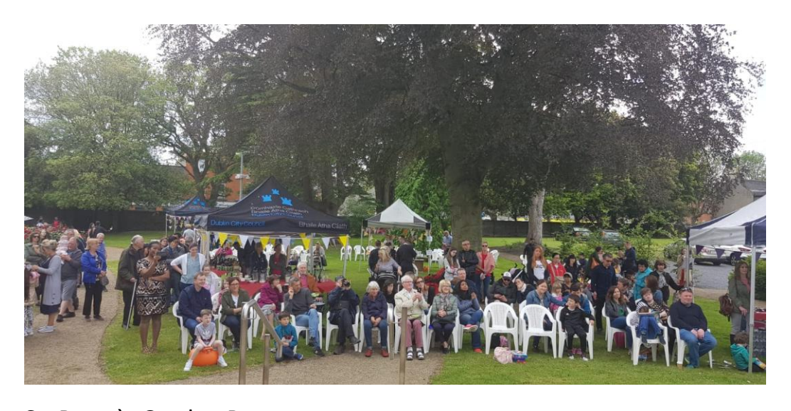
St. Peter's Garden Party.