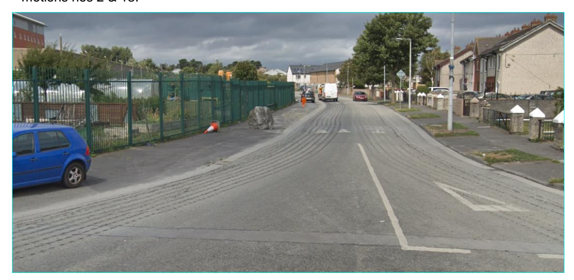
View of Cherry Orchard Green with Community Gardens to the left of the image

objective to support the community garden and allotments as noted above in response to motions nos 2 & 13.