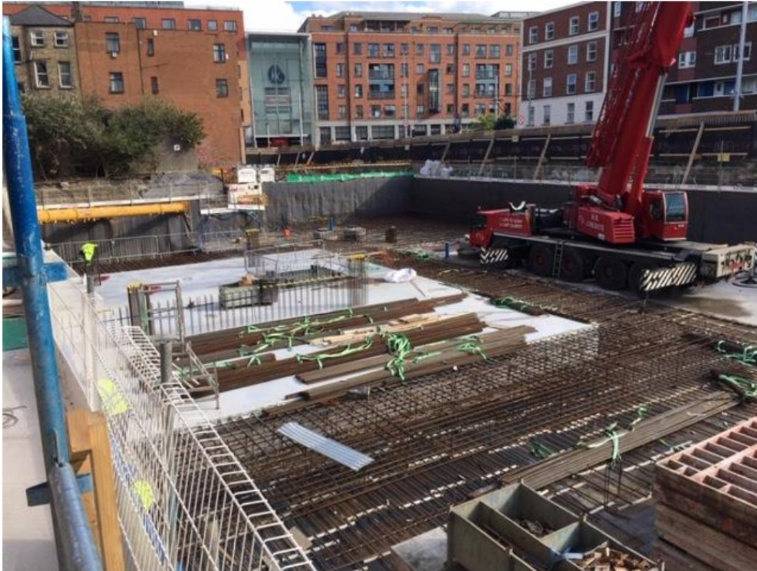
Concrete cast on pour 1 basement slab including Tower Crane base