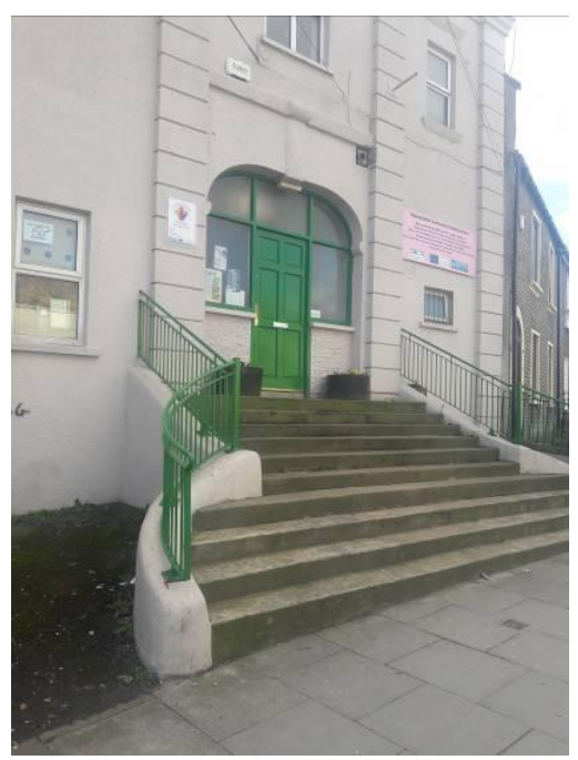
Sweeping entrance steps