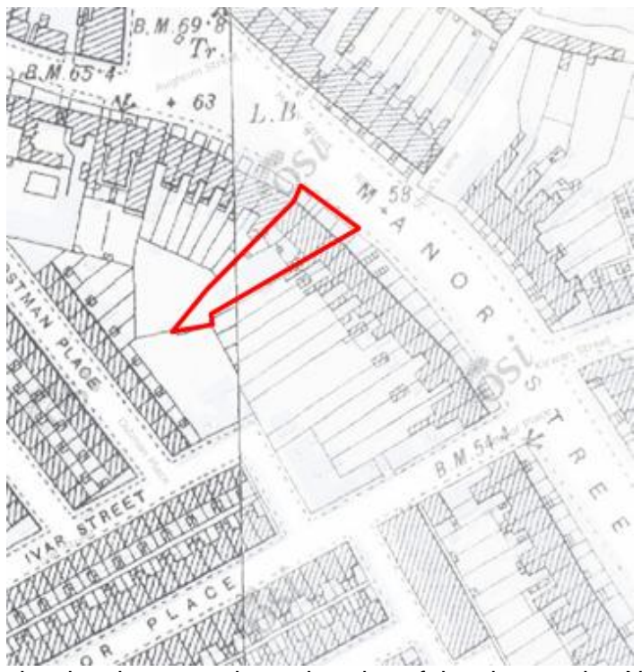
1913 OSi map showing the approximate location of the cinema site. Note the wedge shaped site is more apparent (http://map.geohive.ie/mapviewer.html, accessed 19/09/18)