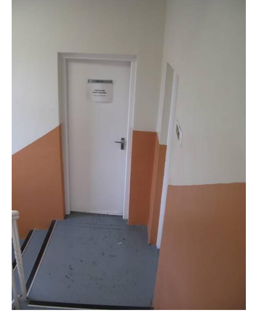
Half landing toilet