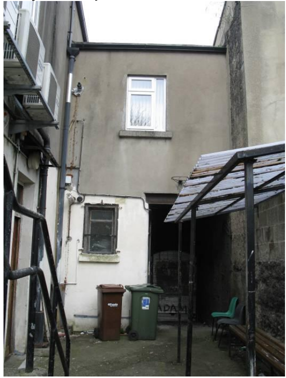
Rear elevation of two-storey extension