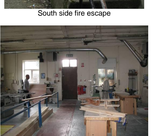
Ground floor workshop to west