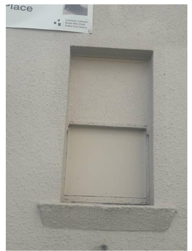
Original single pane timber sash window with distinctive chamfered cill