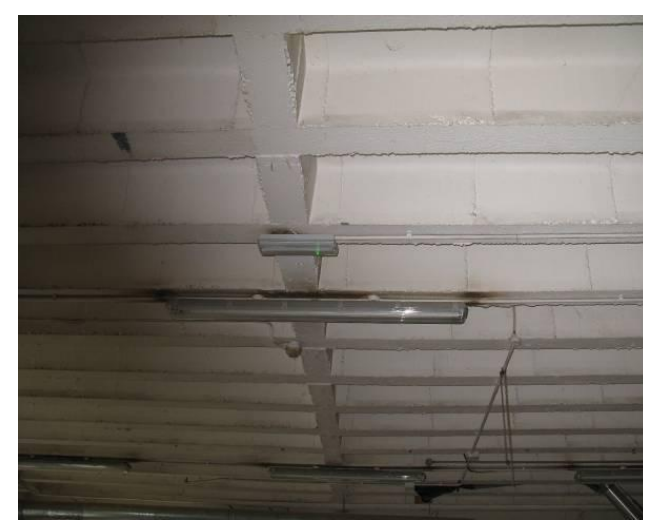
Ground floor inserted ceiling