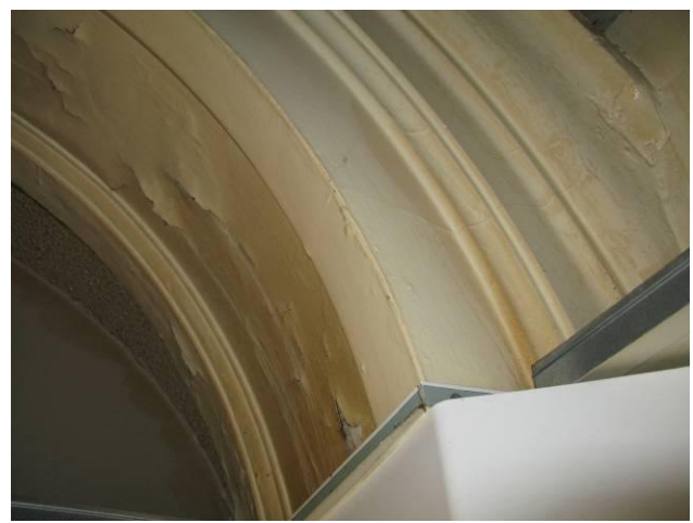
Detail of moulded plasterwork