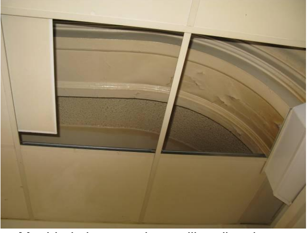
Moulded plasterwork to ceiling ribs above kitchen