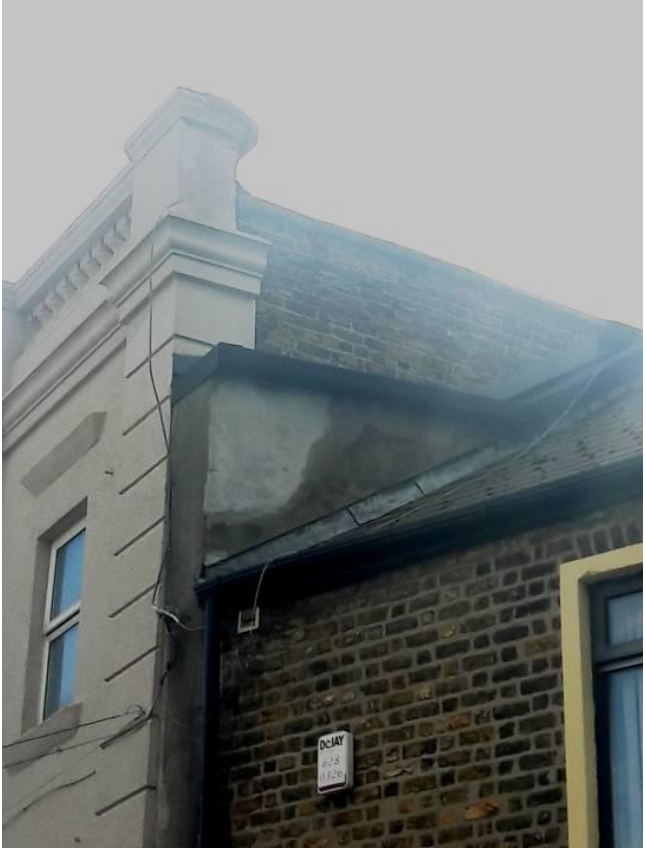
North east corner junction between rendered façade and yellow brick north elevation