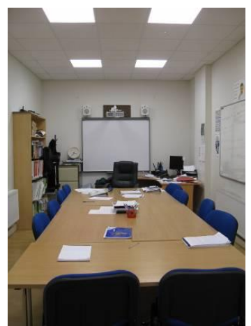
Ground floor classroom to north