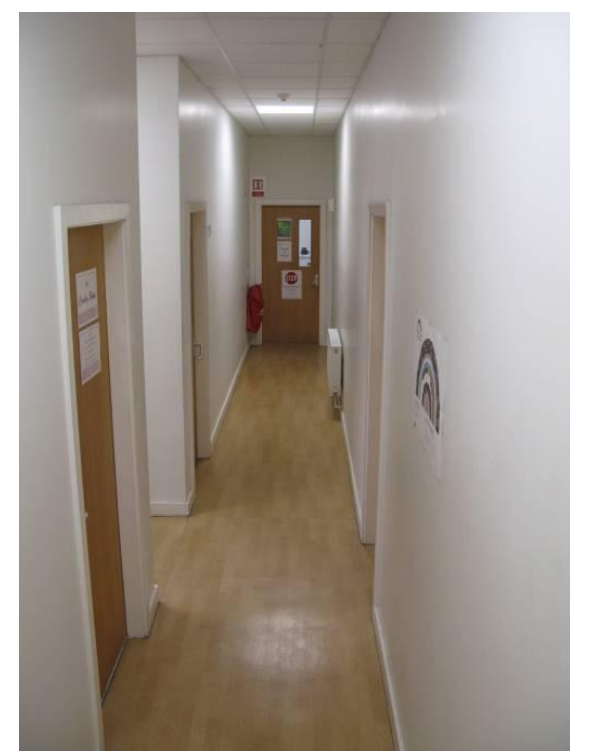
Ground floor central corridor