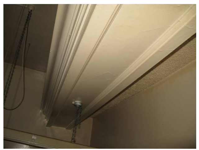
Cornice detail to auditorium ceiling adjacent to north wall.