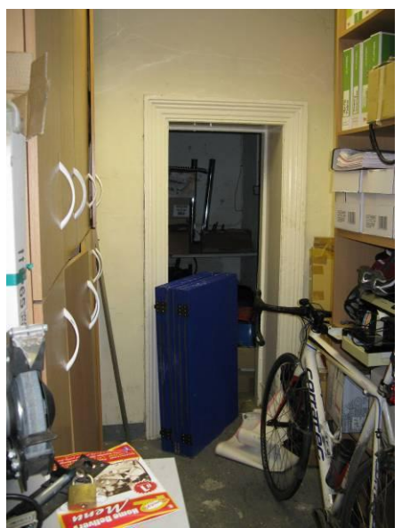
Original architrave to ground floor cupboard