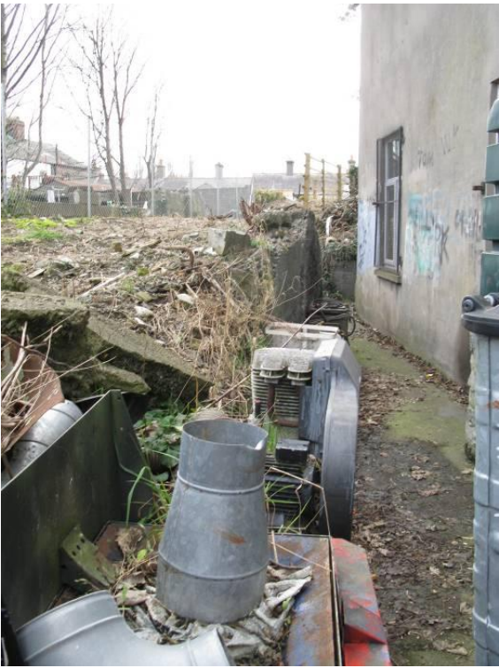
View of the rear site