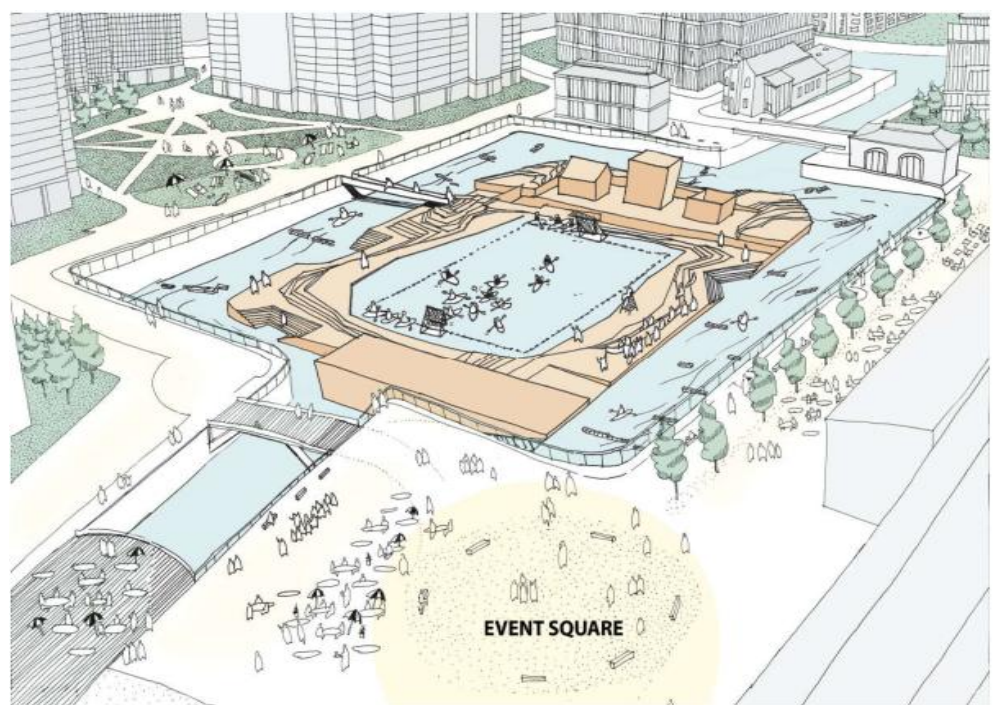
Indicative Overview of Proposed Development