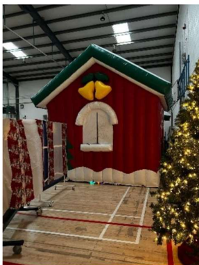
Donnycarney West Christmas Grotto