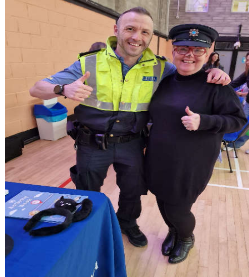
Above picture's – Kilmore Halloween Event