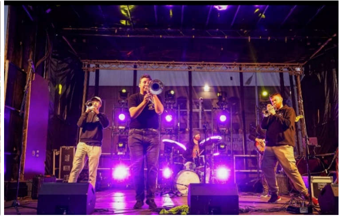
Above picture's - Darndale Together After Dark