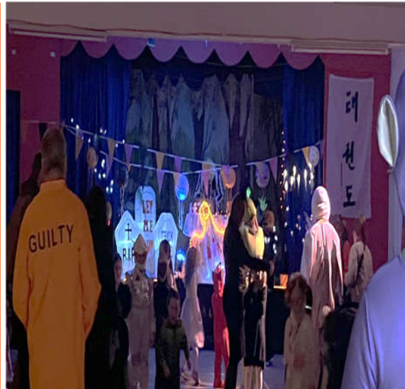
Above picture's – Woodlawn & Lorcan Residents Halloween activities