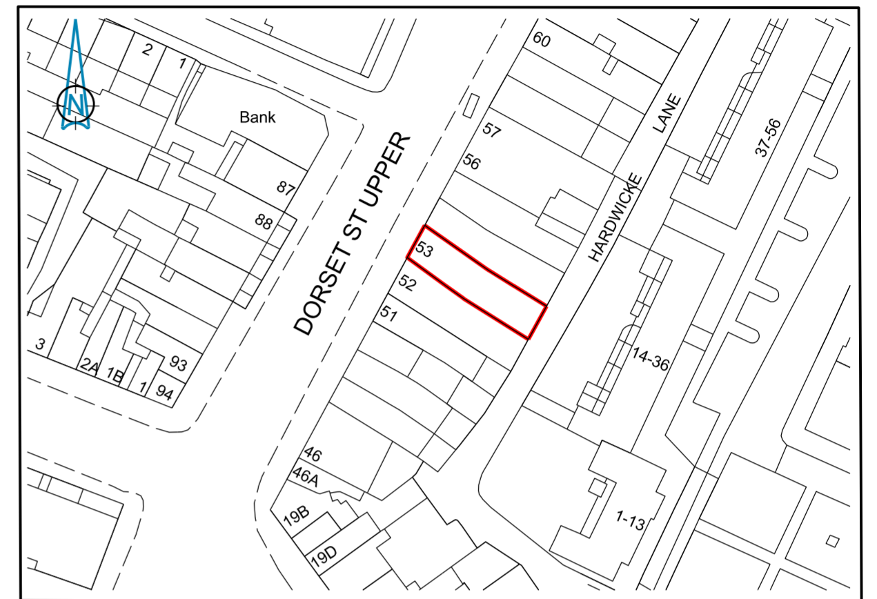
LOCATION MAP Scale 1:1000